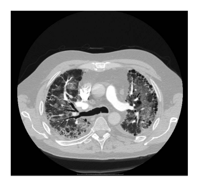
Figure 1. CT scan with diffuse ground glass opacities with basal subpleural honeycombing in both lungs

On admission the patient was in a severe general condition, afebrile, with tachypnoe 29/min, heart rate 100/min, and blood pressure 100/80 mm Hg. On auscultation, crackles in the middle and basal lung areas were found. The analysis of arterial blood gases revealed hypoxaemia (PaO<sub>2</sub> 42.1 mm Hg) and hypocapnia (PaCO<sub>2</sub> 23.2 mm Hg); other relevant laboratory findings included elevated levels of C-reactive protein (259 mg/L, normal range 0-10 mg/L), procalcitonin (0.56 ng/ ml, normal range 0-0.5 ng/ml), d-dimer (1888 ng/mL, normal range 0-500 ng/mL), creatinine (1.67 mg/dL, normal range 0.5-1.1) and increased activity of troponin (1.88 ng/mL, normal range 0.0-0.1 ng/mL), transaminases (ALT 172 U/L and AST 205 U/L, normal range 7-56 U/L and 5-40 U/L, respectively), and natriuretic peptide (747 pg/mL, normal range 0-125 pg/mL). The leukocyte count was normal, but an increased neutrophil count and decreased lymphocyte count were observed (86.3% and 8.0%, respectively). The remaining laboratory findings were unremarkable. The chest radiograph revealed bilateral interstitial opacities, more pronounced in the left lung. Spiral computed tomography of