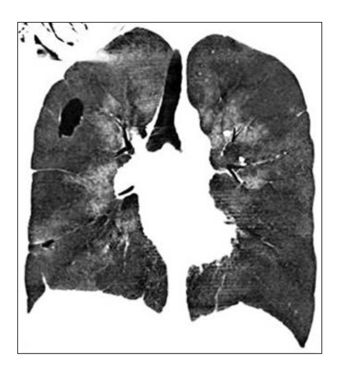
Figure 2. Chest angio CT — frontal view (reconstruction) in a patient with CTEPH and mycobacterial lung disease. The cavity seen in the right lung is localised in the hypoperfused area

In all patients with CTEPH, lesions related to NTMLD occurred in hypoperfused lung areas (Figure 2). In eight patients with CTEPH, there were no reports of new thrombi in pulmonary