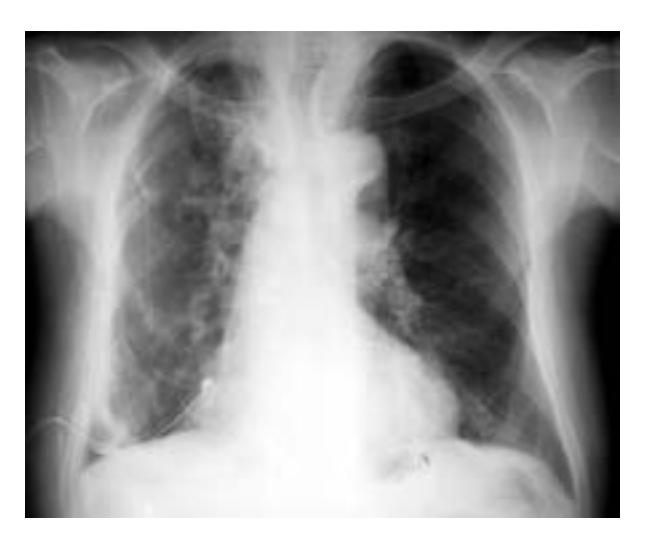
Figure 4. U.G. male 70 years of age, mesothelioma of the pleura, radiological control of the position of the chest tube