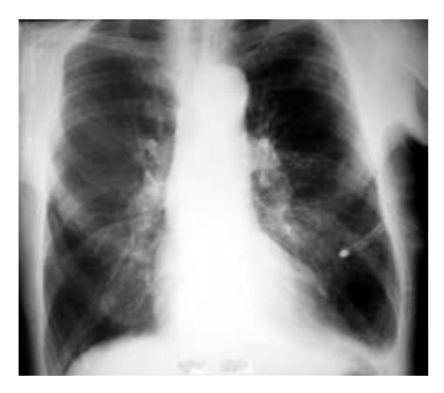
Figure 3. P.M. male 86 years of age, persistent exudate of unknown orygin with symptomatic treatment, radiological control of the position of the chest tube