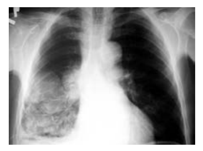
Figure 2. P.A. male 65 years of age, mesothelioma of the pleura, radiological control of the position of the chest tube

luated on the grounds of a radiogram performed