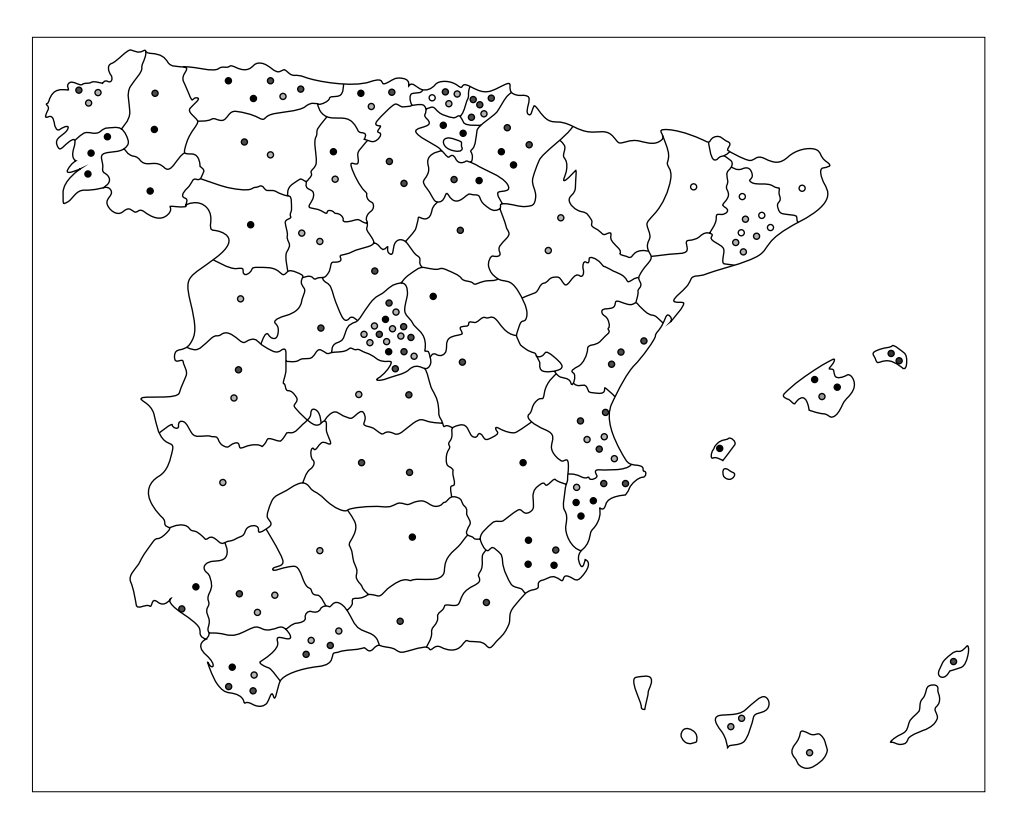
Figure 1. Participation of the different autonomous communities in AUDIPOC

is a growing body of evidence in different countries supporting the relationship between hospital resources and clinical outcomes.