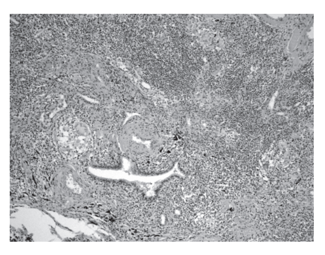
Figure 2. Sjögren's syndrome. Fragment of pulmonary tissue with diffuse lymphoid infiltrate and interstitial fibrosis. Poorly formed granulomas with multinucleated giant cells seen.

Immunohistochemical studies showed that the cellular infiltrate that distended the alveolar