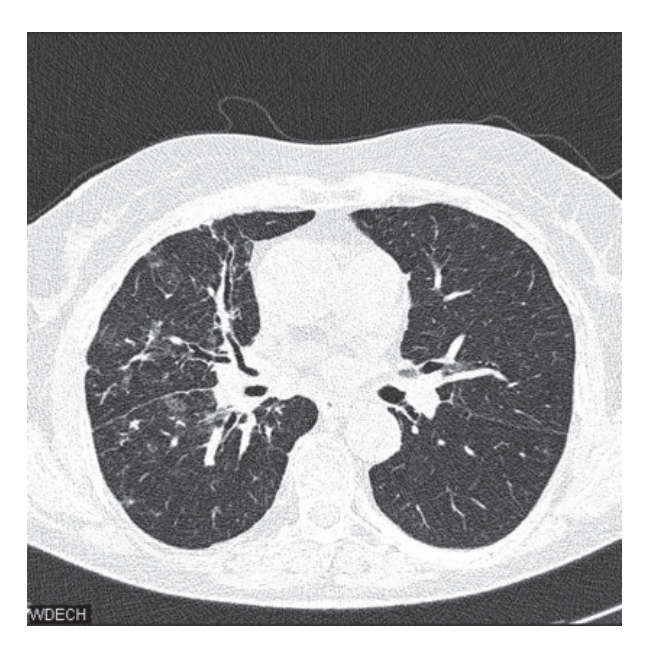
Figure 3. CT scan (December 2005) — marked regression of pulmonary consolidations after course of treatment