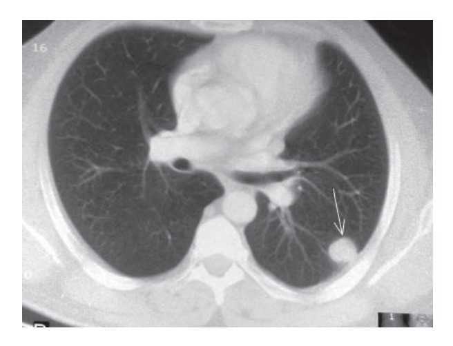
Figure 1. Solid tumor 2 cm of diameter visible in the chest computed tomography in the left lung near chest wall in scapular line (tumor marked by arrow)