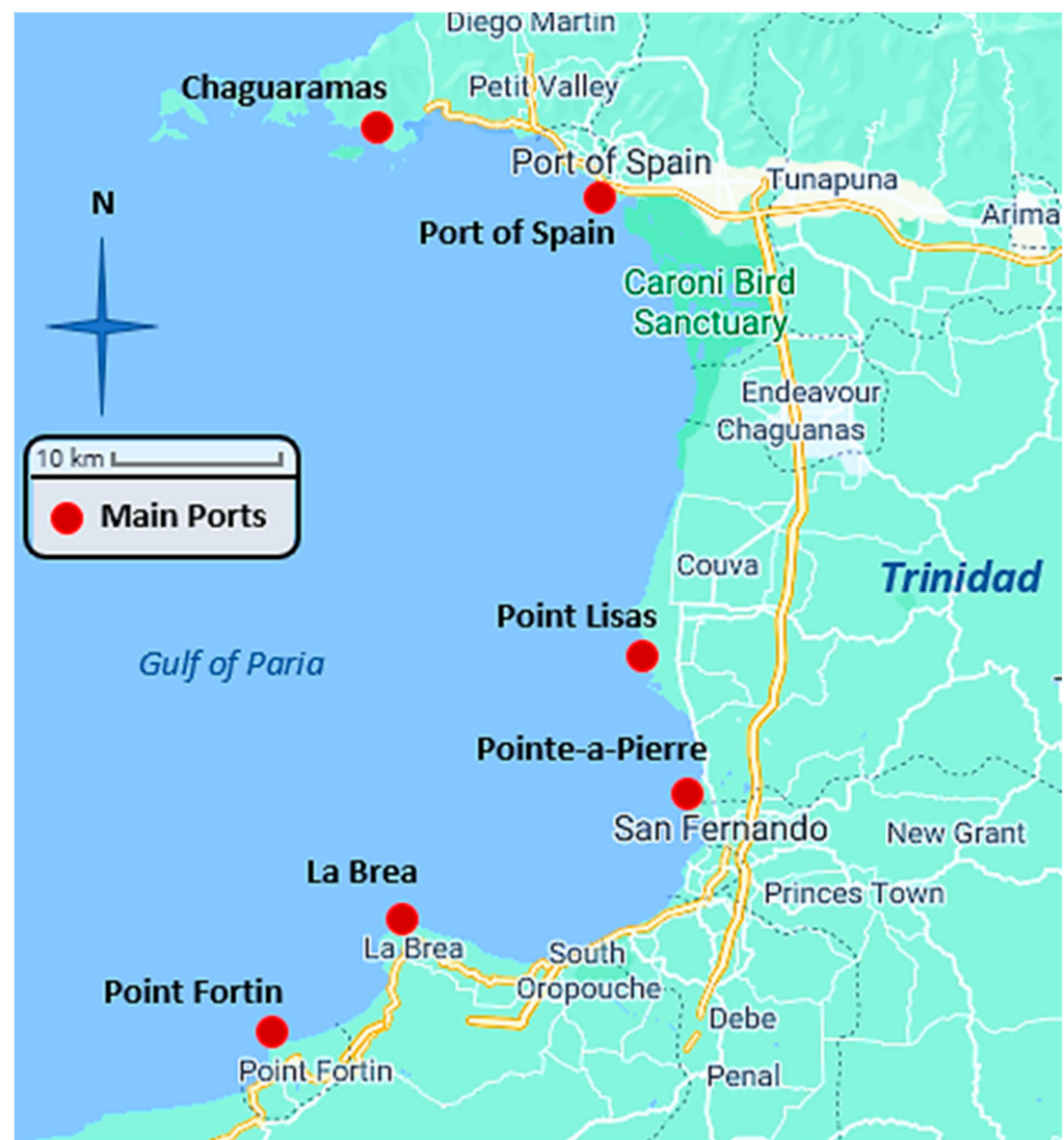
Figure 2. Main Ports in the Gulf of Paria, Trinidad. Adapted from [17].

UAS use in other sectors can help bridge the gap in maritime-specific implementations, as similarities benefit all users [9]. However, additional research and observations in the local maritime industry are essential to accurately assess the practicability of a UAS ship–shore delivery service within Trinidad's leading ports. The main ports described in this report are located on the island's west coast, bordered by the Gulf of Paria, and refer specifically to the ports located in Chaguaramas, Port-of-Spain, Point Lisas, Pointe-a-Pierre, La Brea, and Point Fortin. Figure 2 displays the geographical location of these main ports.