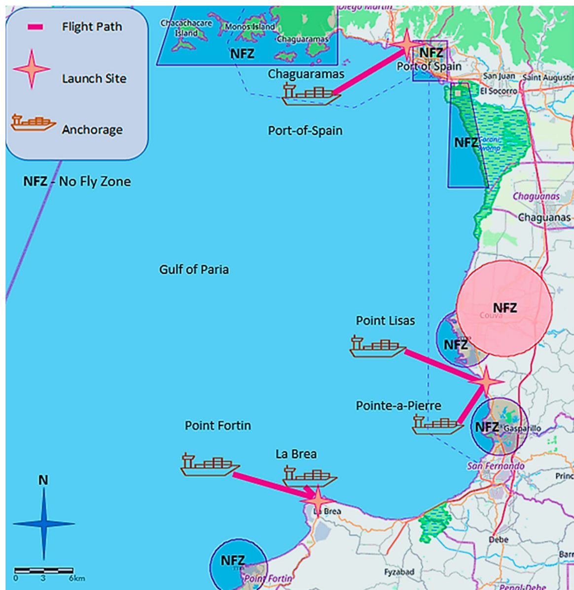
Figure 4. UAS proposed flight path in the Gulf of Paria, Trinidad. Adapted from [22].