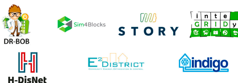
Figure 1. Logos of projects which participated to the workshop.