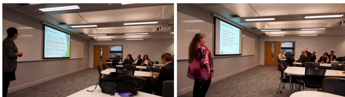
Figure 2. Pictures from the workshop.