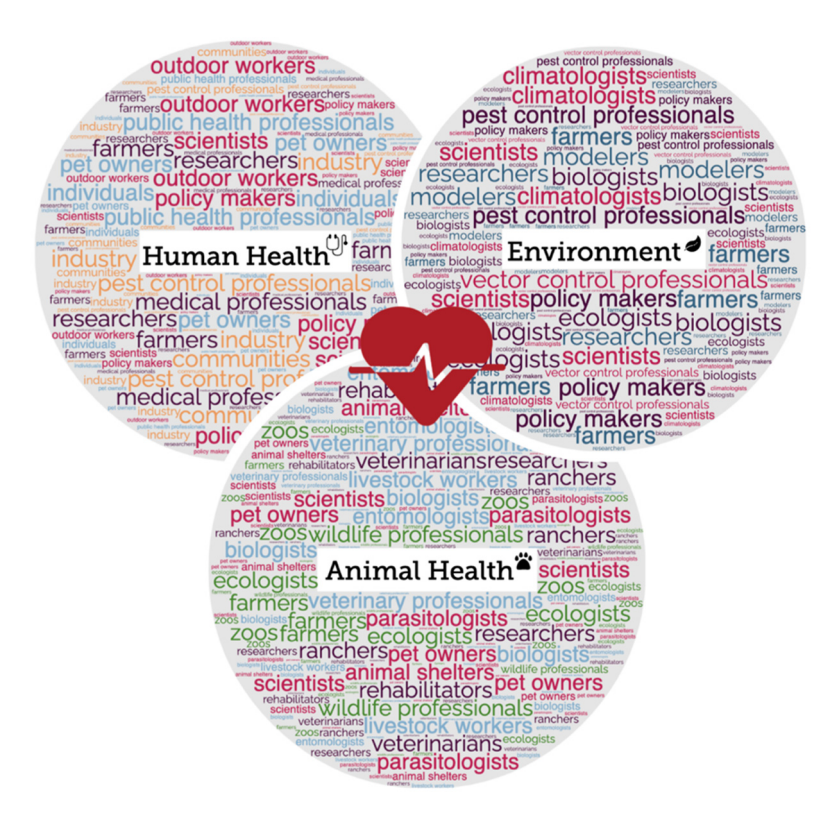
Figure 1. A One Health approach ensures collaboration among the three health sectors—human, animal, and environmental health. Tick control requires collaborative strategies to mitigate disease risk to humans and animals and will require dynamic planning at the agency, community, and individual levels, as highlighted by the examples in this diagram (figure created in the Mind the Graph platform, www.mindthegraph.com, Cactus Communications and Wordclouds.com).

als, policy-makers, and researchers to collaborate to better understand how tick-borne pathogens are moved in the environment and how they may manifest in disease in different host species [45] (Figure 1). While these efforts can be led by the scientific community, input and collaboration from scientists and non-scientists alike will be necessary to identify and implement effective long-term solutions.