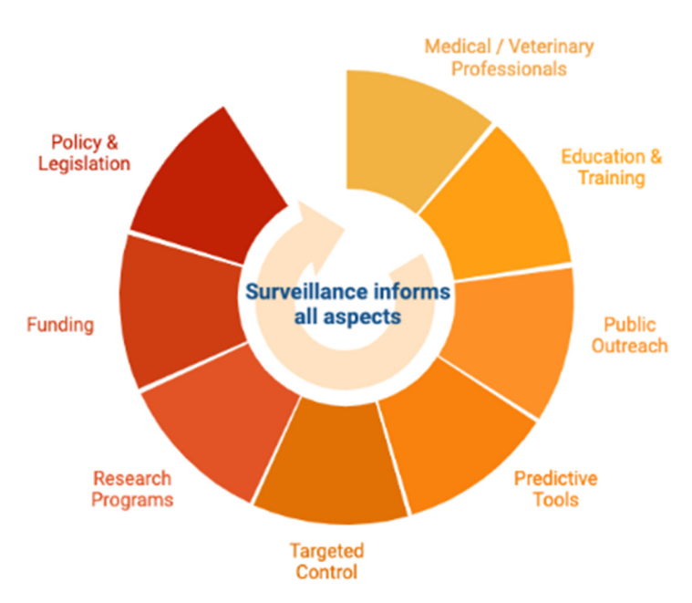
Figure 3. Effective tick control requires continued surveillance and adaptive control, management, and education to fit the current and predicted future needs of the populace (figure created with BioRender.com).

Models have shown conflicting results on the effects of climate change on tick distributions and tick-borne disease risks, as can be expected with complex systems, and have shown much broader habitat suitability than current species records indicate in many cases [54]. Additionally, macro- and micro-habitats are critically important in interpreting and extrapolating model predictions. For instance, models in Canada have shown the importance of warmer, milder winters in the range expansion of I. scapularis . In contrast, models in the northeastern U.S., where Lyme disease is endemic, have not detected a significant effect of weather conditions on tick densities in the following years [95]. There are numerous varied and complex differences between these two systems, but the difference in importance of a critical predictor such as temperature highlights the caution needed for extrapolating results to different habitats, and particularly within policy and control applications. Models used in combination with long-term classical surveillance have been effective in developing control and management strategies in public health contexts, as evidenced by I. scapularis range expansions in the U.S. and Canada [54,59,96], as well as within veterinary health contexts, such as in Rhipicephalus spp. in cattle-wildlife grazing systems in Kenya [97–100].