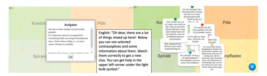
Figure 1. Characteristics of contraceptives.

The DEER must be worked through in a linear sequence, which means that the puzzles have to be solved in the given order (sequential ER [22]). This had to be completed while pressed for time and the countdown was visible on the screen in the classroom. The topic of the DEER was sex education, more precisely, pregnancy and contraceptives. Sex education is a central topic in biology, and, above all, it is a very tricky topic. Biology teachers tend to find it difficult to teach since talking about it is often difficult for students and adults. Additionally, it is an embarrassing topic for students, and they often react with laughter.