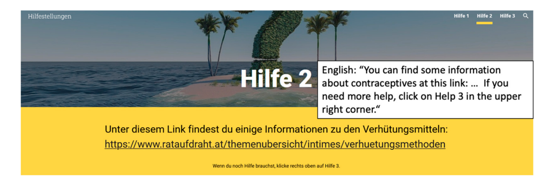
Figure 3. Example of a sequential learning aid.

In one condition, additional sequential learning aids were implemented. Examples concerning these aids were as follows: "Take another look at the virtual lab and search