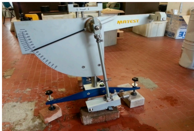
Figure 4. Pendulum friction tester during the skid resistance tests on concrete paving blocks.

The pendulum friction tester is proposed for the evaluation of the skid resistance. The friction force offered by a wetted surface to a rubber slider sliding on it, is measured in terms of reduction in length of the slider swing using a calibrated scale on the equipment (Figure 4).