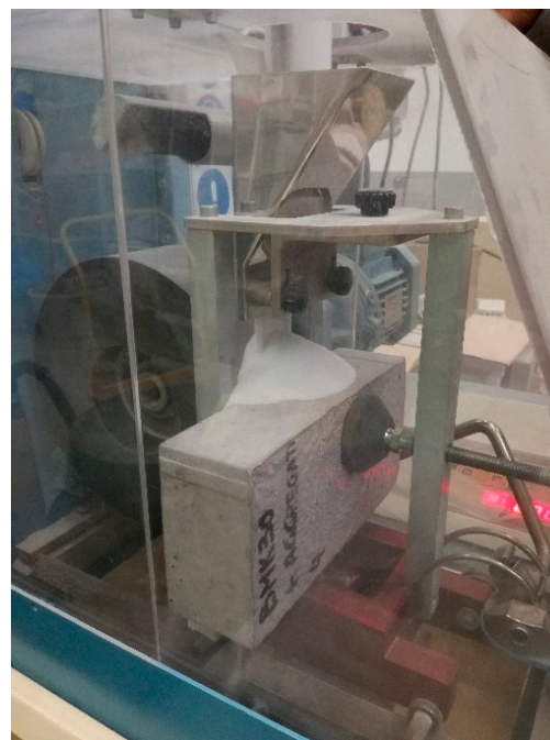
Figure 3. Wide Wheel Abrasion test on Paving Block Paste (PBP) sample.

This property of the paving blocks is evaluated through the Wide Wheel Abrasion test. According to the standard, the abrasive force is generated by an abrasive material, which flows on a rotating wheel that acts on the paving blocks surface (EN 1338, Annex G) (Figure 3).