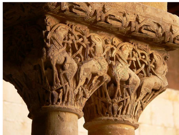
Figure 3. Lions turning their backs on each other. Capital n° 6 from the East gallery of Santo Domingo de Silos cloister; first quarter of the 12th century. (Photo: Inés Monteiro).

The casket seems to have an initial bearing on the lower cloister of the Silos monastery, whose capitals are deeply drilled with a notable stylistic influence from Andalusí ivories, as various scholars have already noticed ([28], p. 21) and [29]. Capital No. 6 in the east gallery (dated towards the first quarter of the 12th century 7 ) presents pairs of lions turning their backs and turning their heads backwards (Figure 3). The proportions of their heads, the disposition of their eyes and the incisions of their fur are very similar to those of the lions that form a cross with their bodies juxtaposed on the two broad faces of Ibn Zayyan’s casket (Figure 4), as already observed by Pérez de Urbel ([28], pp. 22–23) 8 . These lions are, however, trapped by vegetal tendrils in the capital within a Christian symbolic discourse. Boto has also found similarities between the griffins and quadrupeds in this piece and an illustration from the Beatus of Fernando I and Sancha (c. 1047), where fantastic animals appear with very similar curved tails, arranged in the same way, in a horizontal register 9 .