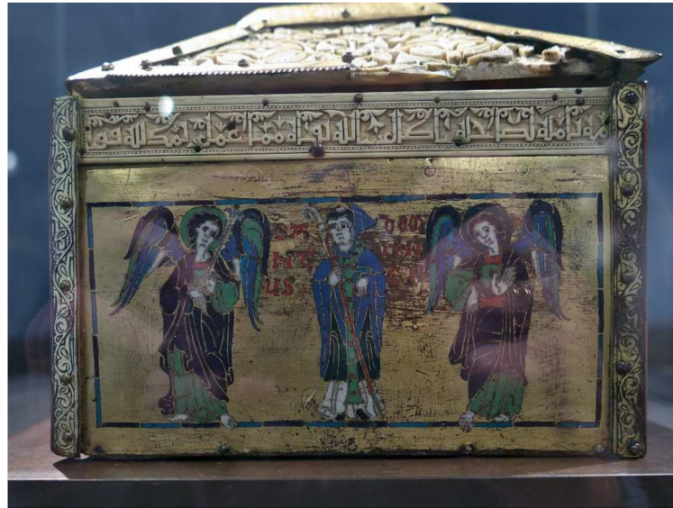
Figure 2. Saint Dominic with two angels. Enamel plaque on the left side of the casket from Santo Domingo de Silos, 1026 A.D. Currently in the Museo de Burgos, Spain

technique representing an Agnus Dei on the top of the lid (an image of Christ as the “Lamb of God”) and Santo Domingo between two angels, on the left side of the box (Figure 2). The Silos enamel workshop was extremely active between approximately 1140 and the end of the 12th century. Although this workshop and its chronology are still a matter of debate, a recent analysis established the date of 1140–1150 for the enamels of the Silos Chest, which is the most accepted chronology [23] and ([24] pp. 1–31).