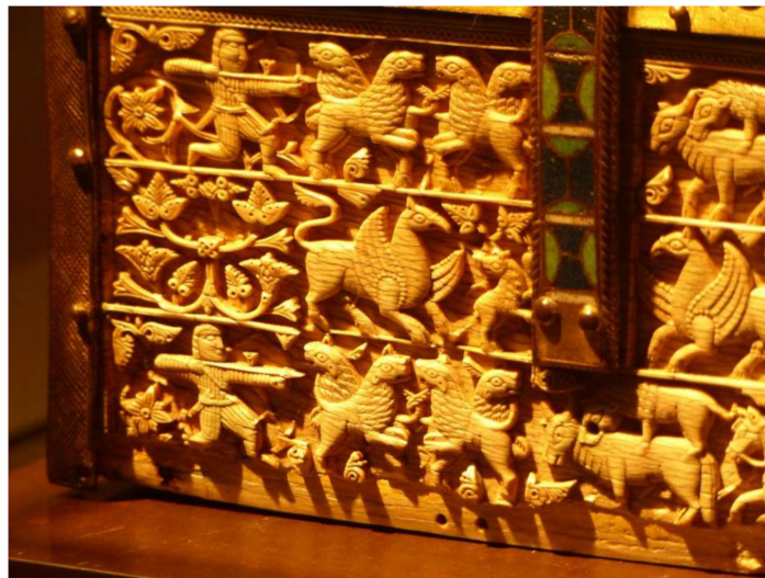
Figure 4. Archers, lions with juxtaposed bodies and lions attacking bulls on the front plaque of the casket from Santo Domingo de Silos, 1026, currently in the Museo de Burgos, Spain.

On the right-side plaque of the Silos casket, two affronted peacocks with intertwined necks can be observed (Figure 5). This is a recurring theme in the Andalusí carvings of the ‘Amirid period, and we find it, for example, in the casket at the Victoria and Albert Museum in London from the early 11th century (inv. n° 10, 1866). This motif also has its parallels in some Romanesque examples, such as in a corbel in the church of Santa Marta del Cerro in Segovia, from the early 13th century, where the same pattern is adopted, although with a more heavy-handed carving and a different arrangement of the birds’ bodies, appearing vertically to conform to the shape of the corbel (Figure 6). The motif of a pair of birds intertwined by their necks appears in other Romanesque reliefs, such as on a capital from the church of San Miguel in San Esteban de Gormaz in Soria (Figure 7).