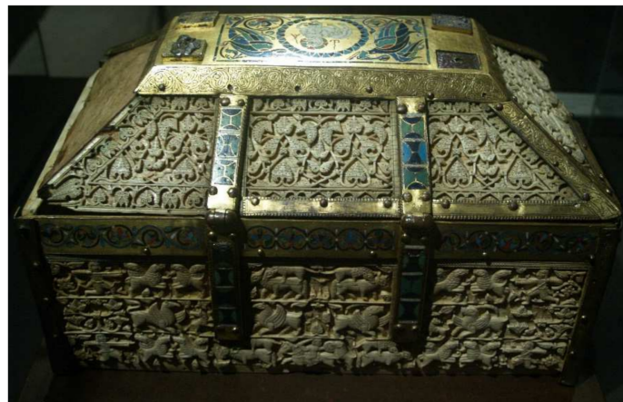
Figure 1. Ivory casket from Santo Domingo de Silos, made by Mohammad ibn Zayyan in 1026. Currently in the Museo de Burgos, Spain (Photo: Inés Monteiro).

The Silos casket represents a key example in that we know in what context it was manufactured and that its second life in Christian hands began early (Figure 1). This ivory box measures 35 × 19 × 21 cm (width × height × depth). It was made in Cuenca in A.D. 1026 (417 H) by the artist Mohammad ibn Zayyan, as revealed by the Kufic inscription that runs through it. It was probably a commission from the Dhu'l-Nunid family that ruled the Taifa of Toledo at the beginning of the 11th century, although the part of the inscription that indicates the recipient is lost. It may have been mutilated through Christian intervention on the piece, as will be argued later on. According to several specialists, the hunting and fighting scenes between animals that decorate this casket were intended to symbolise the territorial power of the owner of the piece, while the vegetal motifs evoked paradise and the favour of Allah towards the ruler [19].