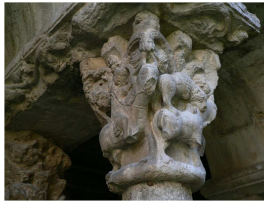
Figure 8. Lion attacking a bull and Almoravid archer on capital n° 4 in the cloister of the cathedral of Santa Maria, Gerona (northwest face).

lion attacking a quadruped in capital No. 4 of the cloister of the cathedral of Santa María de Girona (Figure 8).