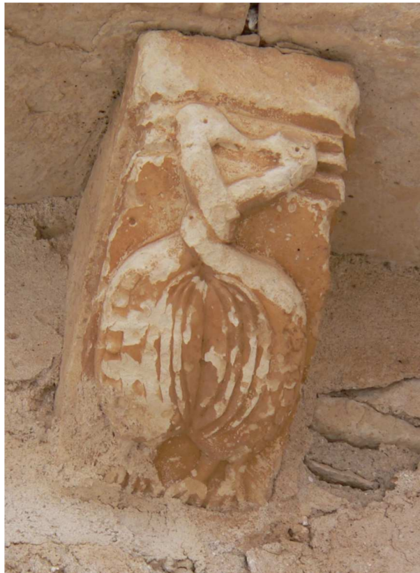
Figure 6. Corbel with birds with intertwined necks from the Romanesque church of Santa Marta del Cerro (Segovia), beginning of the 13th century.