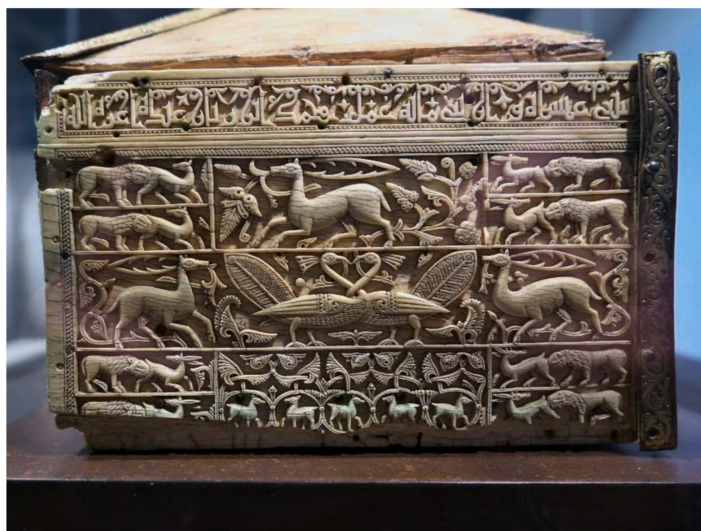
Figure 5. Ivory plaque with peacocks with intertwined necks, and lions with their heads seen from above. Right side of the casket from Santo Domingo de Silos, 1026, currently housed in the Museo de Burgos, Spain.

On the right-side plaque of the Silos casket, two affronted peacocks with intertwined necks can be observed (Figure 5). This is a recurring theme in the Andalusí carvings of the ‘Amirid period, and we find it, for example, in the casket at the Victoria and Albert Museum in London from the early 11th century (inv. n° 10, 1866). This motif also has its parallels in some Romanesque examples, such as in a corbel in the church of Santa Marta del Cerro in Segovia, from the early 13th century, where the same pattern is adopted, although with a more heavy-handed carving and a different arrangement of the birds’ bodies, appearing vertically to conform to the shape of the corbel (Figure 6). The motif of a pair of birds intertwined by their necks appears in other Romanesque reliefs, such as on a capital from the church of San Miguel in San Esteban de Gormaz in Soria (Figure 7).