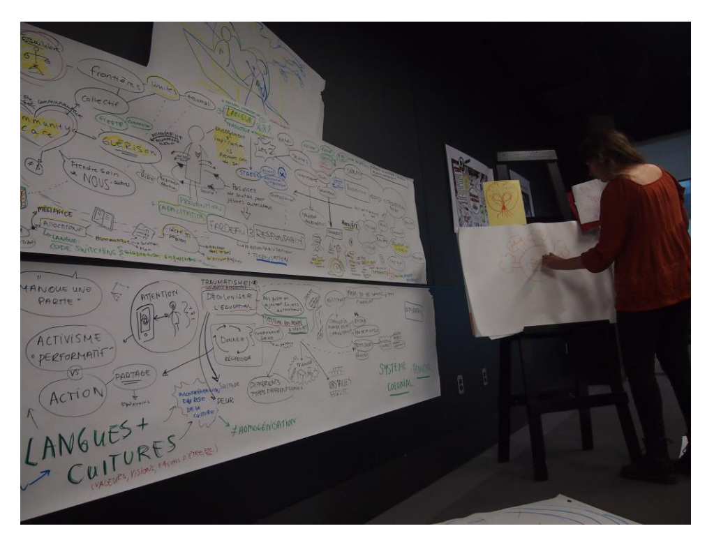
Figure 1. Brainstorm process in creating postcard.

Over a weekend retreat, seven youth advisory committee members met alongside Emanuelle Dufour, graphic facilitator and illustrator, and Véronique Picard, youth advisory coordinator, to discuss this question, taking into account their lived experiences and perspectives. The conversation began with brainstorming, moderated by Véronique, with Emanuelle documenting the discussion (see Figure 1). The rest of the day then focused on the youth selecting the highlights, key terms, and important aspects to be portrayed visually and through their lens, including the choice of imagery, colour schemes, and other aspects. The postcard was finalized through Facebook communications with the youth and Véronique providing feedback on Emanuelle's illustrations (see https://chairejeunesse.ca/prodmultimedias/carte-postale-une-vision-inclusive-et-collective-du-mieux-etre/, accessed on 23 January 2023).