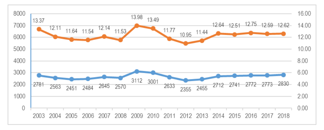
Figure 2. Incidence rate and total accidents recorded by men teachers from 2003 until 2018.

Official accident reports included 58 different variables. Some of them were considered to be personal variables based on the worker injured (age, gender, nationality, duration of service), while some variables described characteristics of the organization where the accident took place (sector, OHS organization, company size), and others provided information about the circumstances of the accident (day of the week, part of the body injured, deviation). The variable for the part of the body injured was selected as the main variable for analysis to measure the impact of crashes in worker anatomy, and accidents were grouped according to the part of the body affected. The remaining variables were then analysed. Based on the statistical significance of the variables, the following eight variables were selected: