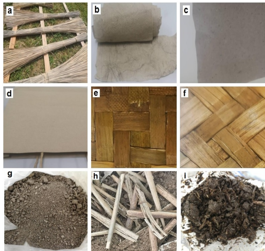
Figure 1. Samples used in this research: (a) Krajoed strips (KS), (b) paper made from Krajoed (PK), (c) shirt backing paper (SP), (d) a bag made of paper (BP), (e) residue of plain weave pattern (RPP), (f) residue of cross weave pattern (RCP), (g) loam soil, (h) Krajoed strip residue in combination with loam soil (KSRL) at day 0, (i) Krajoed strip residue in combination with loam soil (KSRL) at day 60.

Krajoed strip (Figure 1a), Krajoed paper (Figure 1b), the residue from plain weave pattern (Figure 1e), and the residue from cross weave pattern (Figure 1f) were collected from the Krajoed Ban Kum Pae Product Group Community Enterprise, Cha-uat District, Nakhon Si Thammarat Province, Thailand.