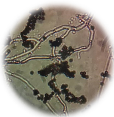
Figure 3. Morphology of Aspergillus sp. detected from Krajoood strips.

The type of fungi detected in Krajoood strips was Aspergillus sp. (Figure 3), while Aspergillus sp. (Figure 4a), Curvularia sp. (Figure 4b), and Cladosporium sp. (Figure 4c) were observed in the paper made from Krajoood.