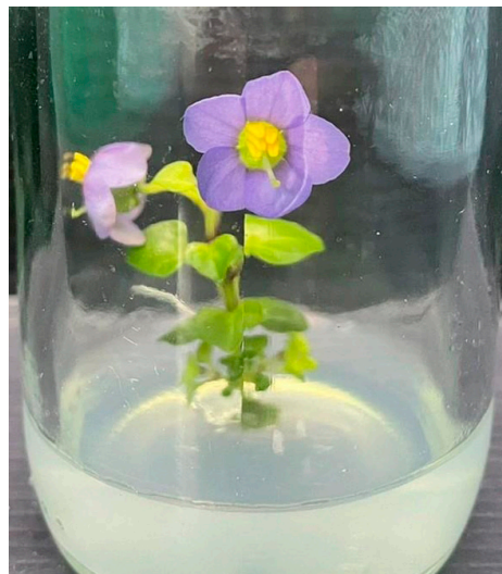
Figure S1. Persian violet flowers grown in the in vitro environment