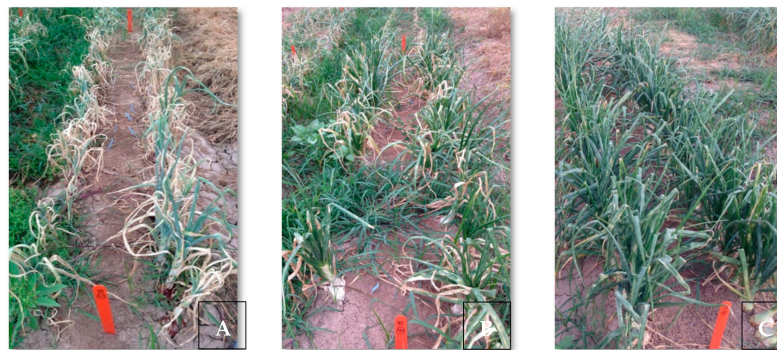
Figure 3. From left to right, IYS symptoms on plants of susceptible check: ‘Rumba’ (A), original population NMSU 07-54-1 (B), and selected breeding line NMSU 12-337 (C) when grown in field conditions conducive for disease development.

explanation for fewer IYS symptoms on plants of NMSU 12-239 could be their slower buildup of thrips from 13 WAT to 16 WAT as compared to the plants of NMSU 07-53-1 (Table 2). At 16 weeks, plants of NMSU 12-239 had fewer thrips than plants of NMSU 07-53-1 (Table 2). With fewer thrips per plant, there would be fewer opportunities for thrips to infect plant tissue with IYSV and allow for the subsequent development of associated lesions on leaves after three weeks. In 2014, when fewer disease symptoms were observed on all plants, NMSU 12-239 produced fewer plants with disease symptoms and plants with less severe symptoms than NMSU 07-53-1 at 16 WAT (Table 1). As compared to 2013, fewer thrips were observed on plants in 2014 and as a result, plants of NMSU 12-239 had a similar number of thrips as plants of NMSU 07-53-1 at all three dates (Table 2) and subsequently thrips number was not the reason in differences in IYS disease mentioned previously.