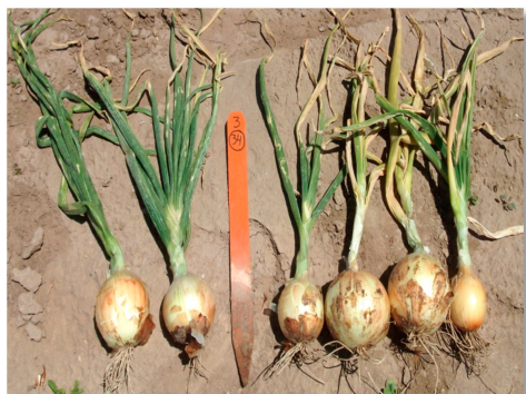
Figure 1. An example of selected plants (left of orange stake) as compared to unselected plants (right of orange stake). Plants were visually selected on the basis of less thrips damage, full bulb maturity, and mainly fewer IYS symptoms. Plants were from New Mexico State University (NMSU) breeding lines with a history of reduced Iris yellow spot (IYS).

check cultivar, ‘Rumba’ (Nunhems USA, Parma, ID, USA), were evaluated to measure the selection progress for reduced IYS symptoms. In 2014, only 5 selected breeding lines, 3 original populations, and ‘Rumba’ were evaluated due to the lack of seed for some of the entries tested in 2013.