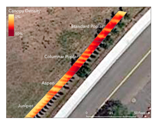
Figure 3. Density in the bottom 3 m of the canopy as measured by light interception. Spatial variability in light interception is shown superimposed on a satellite image (Google Earth) of part of the study area. The satellite image was not taken at the same day or time as the light interception measurements.