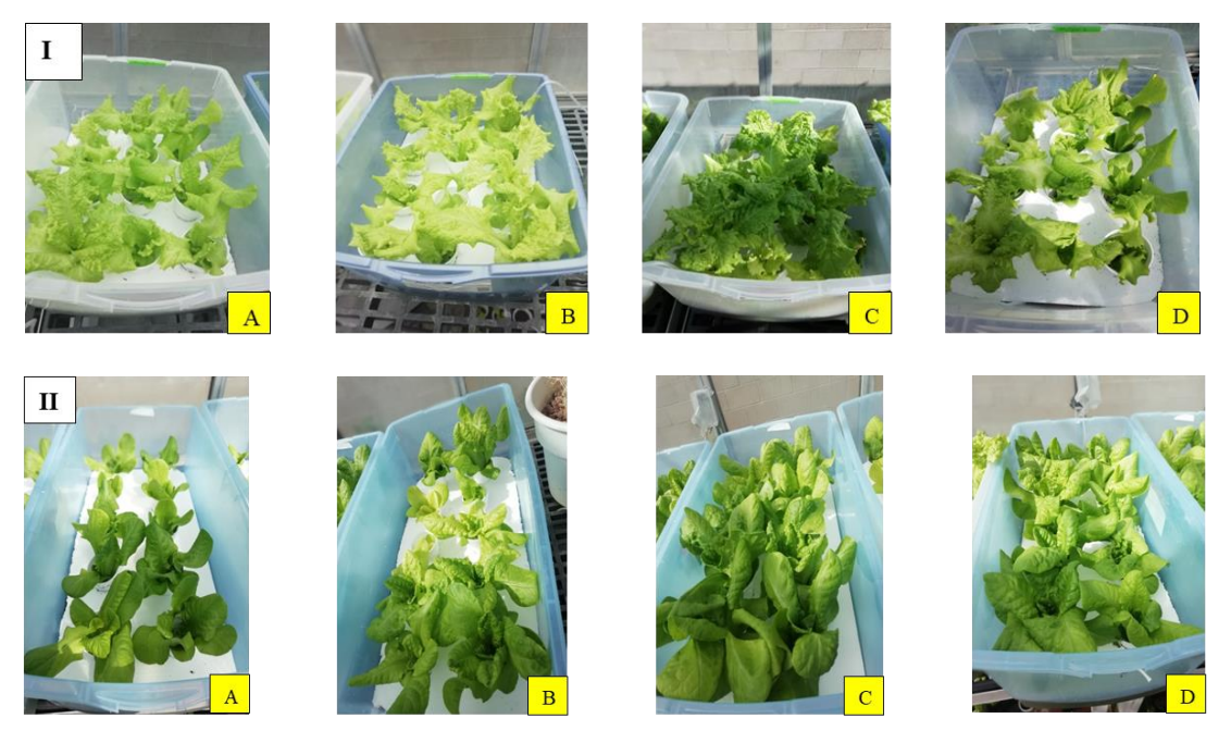
Figure 1. (I) Black Seeded Simpson, (II) Buttercrunch; (A–D) refers to nutrient compositions N1, N2, N3 and N4 respectively.

Overall, the results indicated that N1 and N4 were the poorer nutrient solutions for both cultivars. The N1 and N4 content of macronutrients (N, K and Ca) resulted in lower fresh weight, fewer leaves as well as shorter leaf and root length. For both cultivars, fresh weight, number of leaves, as well as leaf and root length, were highest in the N3 nutrient solution compared to all other solutions (Table 2). Additionally, the reverse relationship was found between Buttercrunch and Black Seeded Simpson cultivars with respect to the number of leaves and leaf length. The growth of lettuce cultivars in different nutrient solutions is shown in Figure 1.