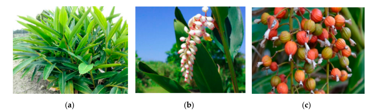
Figure 2. Photos of Alpinia zerumbet plant (a), flower (b) and fruits (c). Adapted from [116].