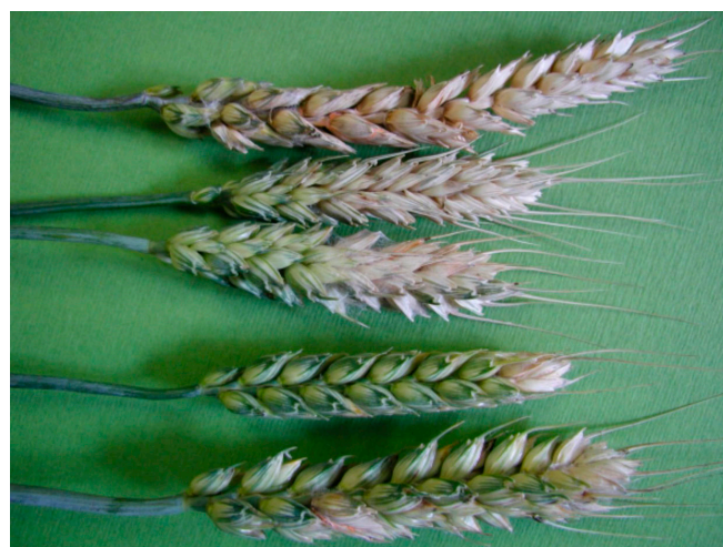
Figure 2. Example of FHB on wheat.

Although, according to MEBAK (Mittleuropäische Brautechnische Analyskomommision), microbiological barley control upon admission to the malt factory includes determining the degree of infection with F. graminearum and F. culmorum fungi, the European Brewing Convention (EBC) requires barley to be controlled only for the presence of total number of fungi from the genus Fusarium [25,26]. Fusarium fungi are held responsible for a small grains cereal disease called FHB (Figure 2).