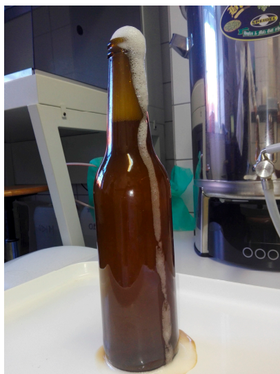
Figure 4. Example of beer gushing.

Gushing was also related with the mycotoxin content in malt, since Schwarz et al. [100], reported that approximately 90% of all malts containing DON are inclined to gush. Sarlin et al. [80], however, reported that hydrophobins and DON in malts do not show any correlation with gushing. According to this, the DON content and gushing potential of malt are not connected.