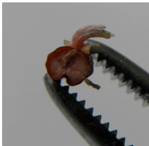
Figure 3. Fusarium -infected wheat malt grain.

This disease classifies the grains as unacceptable and unsuitable for malting, even though all other quality parameters are acceptable for malting [27]. Fusarium spp. are known soil borne pathogens, but in some cases, they can be dispersed by wind and rain [28]. They can survive for more than a year in the soil's surface layer and remain active [29]. The most convenient period for infection is 2–3 days before flowering. Air humidity during wheat anthesis has a huge impact on the FHB development [16,30]. According to Bai and Shaner [31] and McMullen et al. [32], optimal conditions for infection are temperatures (20–25 °C), accompanied by high relative air humidity (>80%). FHB symptoms become visible about two weeks after the infection (green ears become yellow). In rainy periods, barley grains can be colorized with pink or red stains (Figure 3). The consequences of Fusarium infection can be seen in yield decrease, lower average seed dimensions and a decrease in nutritive value—lower starch and proteins mass fractions, loss of colour, and changes in smell and taste of the grain [17,33–35].