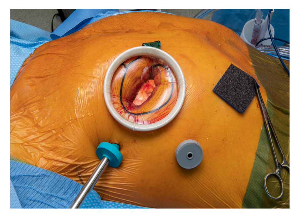
Figure 1. An example of the typical setup for MATVS at the Lancashire cardiac centre. A periareolar skin incision is made with a mini-thoracotomy at the fourth intercostal space with a camera port at the same level (blue trocar). An additional trocar (grey) is placed to facilitate the installation of a cardiotomy succion and/or pericardial stay sutures.

Others have shown that performing tricuspid surgery without caval occlusion is safe due to the air being captured by the active drainage system [31]. This requires very good communication with the perfusion team to avoid air lock of the venous line in case of excessive vacuum assist.