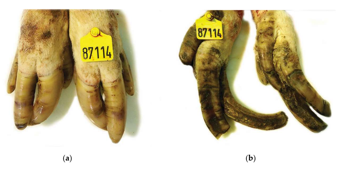
Figure 1. Claw lesions from a culled sow of genetic line A (PIC): (a) Mildly overgrown claws of the front limbs showing small cracks bruises throughout the wall hoof; (b) Severely overgrown and deformed rough claws of the hind limbs with hyperkeratinization, ridges, cracks and erosions near the coronary area. Overgrown dewclaws are also observed.