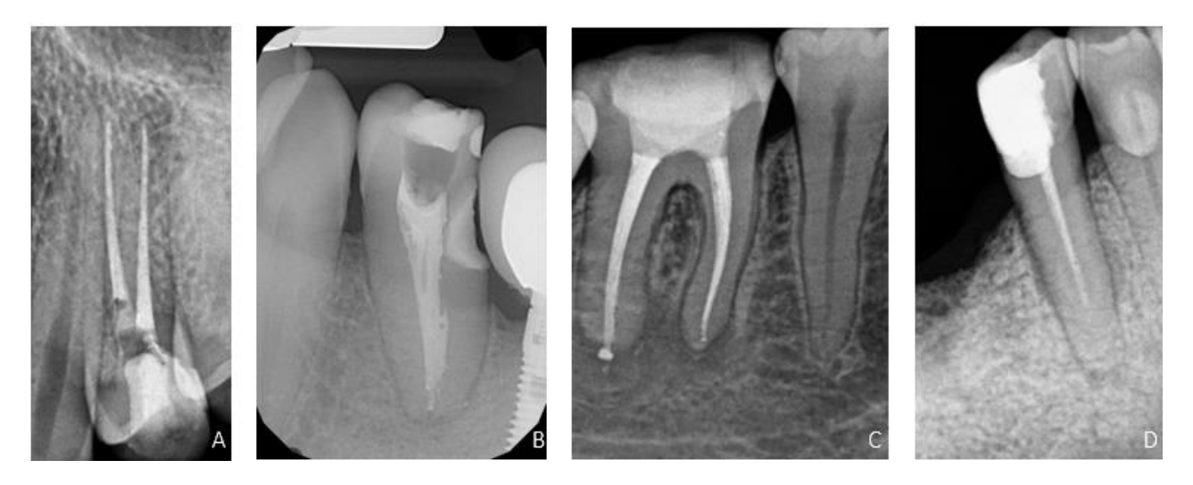
Figure 1. RVG images showing evaluation parameters. ( A ) Adequate length and density, ( B ) Inadequate density, ( C ) Overfilling, ( D ) Short-filling.