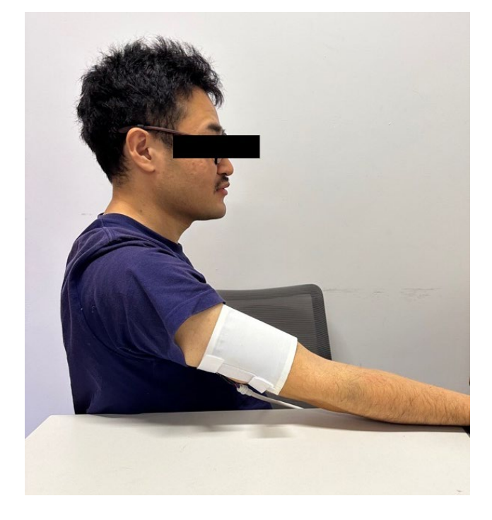
Figure 3. Wearing diagram of the FIR device.