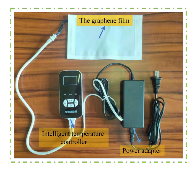
Figure 2. Physical picture of the graphene heating device.

Using the FFGS technique, we successfully fabricated a novel graphene far-infrared transmitter device with adjustable dimensions (Figure 2). The graphene heating device consists of three parts: the graphene film, the intelligent temperature controller, and the power adopter. It offers several advantages for infrared healthcare products: (1) it allows direct contact with the skin and can be heated automatically with adjustable temperature and voltage; (2) it has high intensity and abrasion resistance; (3) it can be prepared into different shapes to fit different parts of the human body; and (4) it exhibits high far-infrared emission efficiency and provides a comfortable warmth sensation.