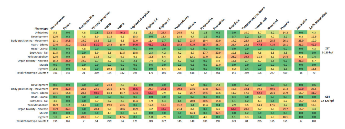
Figure 3. Prevalence of phenotypic groups observed in the ZET (6–120 hpf) and GBT (72–120 hpf) larval toxicity assays for each tested chemical. Phenotypic groups are described in Table 2. The values represent the percentage of times the specified phenotype was observed for all the phenotypic observations of all exposure replicates for each compound. Values are color coded from highest percentage to lowest percentage as red to orange to yellow to green. The total number of phenotypic counts observed for each tested chemical is listed below each column. Note: low phenotypic counts for larvae exposed to Amoxicillin and Dechlorane Plus in both assays.

As shown in Figure 3, the majority of phenotypic observations for all chemicals tested in the ZET assay involved alterations in heart functioning and edema (15.9–50.1%). Altered phenotypes in this group are observed for many larval zebrafish toxicant exposures (reviewed in [19]). The next most prevalent phenotypes in the ZET assay were alterations to body-positioning and movement. In most cases, this involved the observation of a loss in lateral recumbency. Alterations in yolk metabolism were found for a subset of the chemicals tested in the ZET assay, making up more than 10% of the observed phenotypes for Benzophenone, Tricresyl phosphate, Bisphenol A, Aldicarb, Pyriproxyfen, Permethrin, Raloxifene HCl, Testosterone propionate, Valproic acid and Propofol. Alterations in yolk metabolism are well established for endocrine disrupting chemicals such as Bisphenol A [20,21] and for other chemicals disrupting the peroxisome proliferator-activated receptor (PPAR) pathway [22].