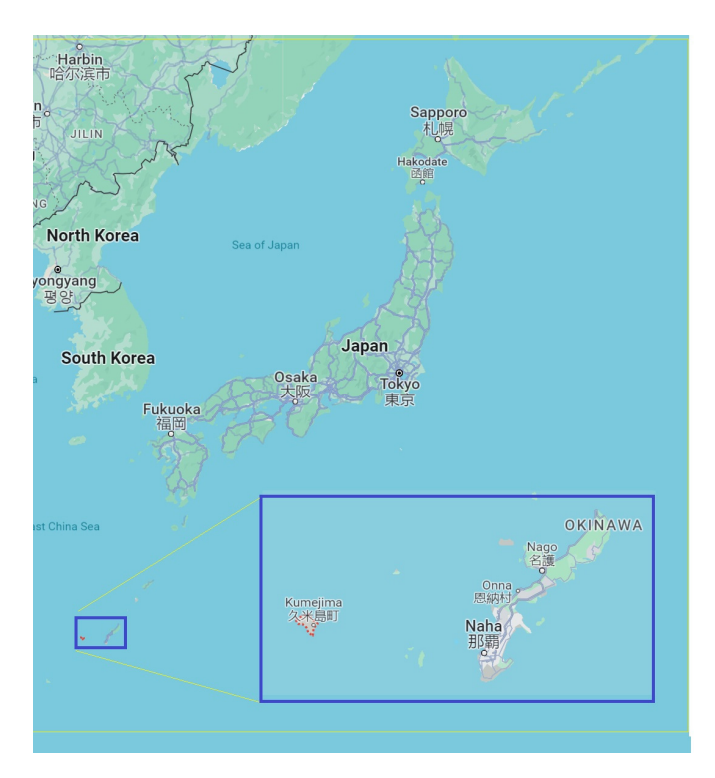
Figure 1. A map to illustrate the geography of the island with respect to Japan.

This study was conducted on people aged 65 years or older, who did not require nursing care, and who lived in Kumejima-cho, Okinawa Prefecture. Kumejima-cho, the surveyed area, is located on the East China Sea, 100 km west of Naha City on the main island of Okinawa, and is an island region with a circumference of approximately 48 km and an area of 63.65 km² (Figure 1). There are three to five daily air flights from Okinawa Naha Airport, which take approximately 25 min. There are one to two boat services a day, which take about three hours.