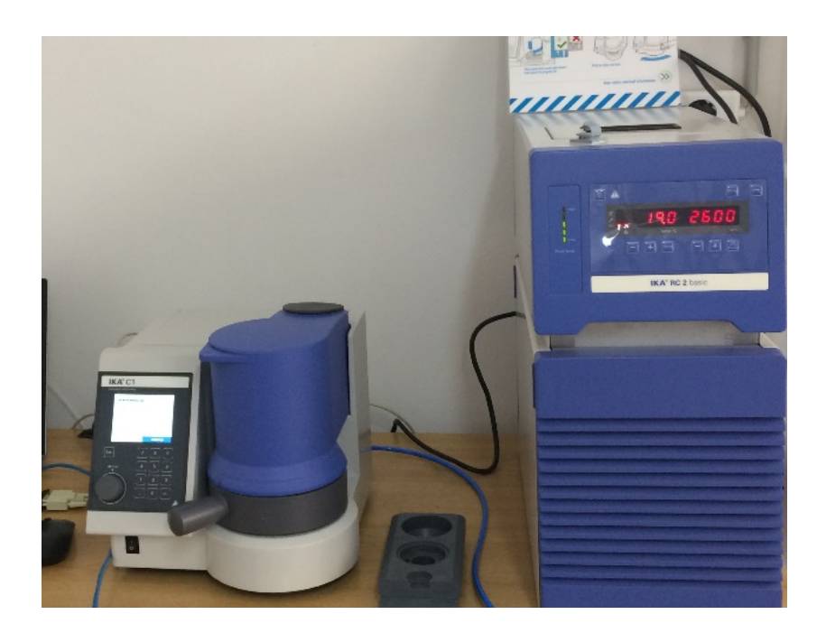
Figure 4. Calorimetric analysis for MSW sample.

The test sample was introduced into the decomposition vessel, where the burning under excess of oxygen in a closed container took place. The amount of heat resulting from this, measured by a previously calibrated system, allows the value of the calorific value of the sample to be determined.