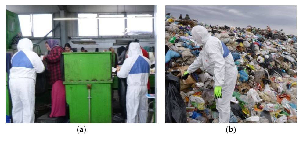
Figure 2. Samples collection: (a) From la Satu Nou de Jos; (b) from Teplite.

Each waste bag was marked with the date of collection, the place of collection, and the percentage composition (%) was classified into seven categories as follows: