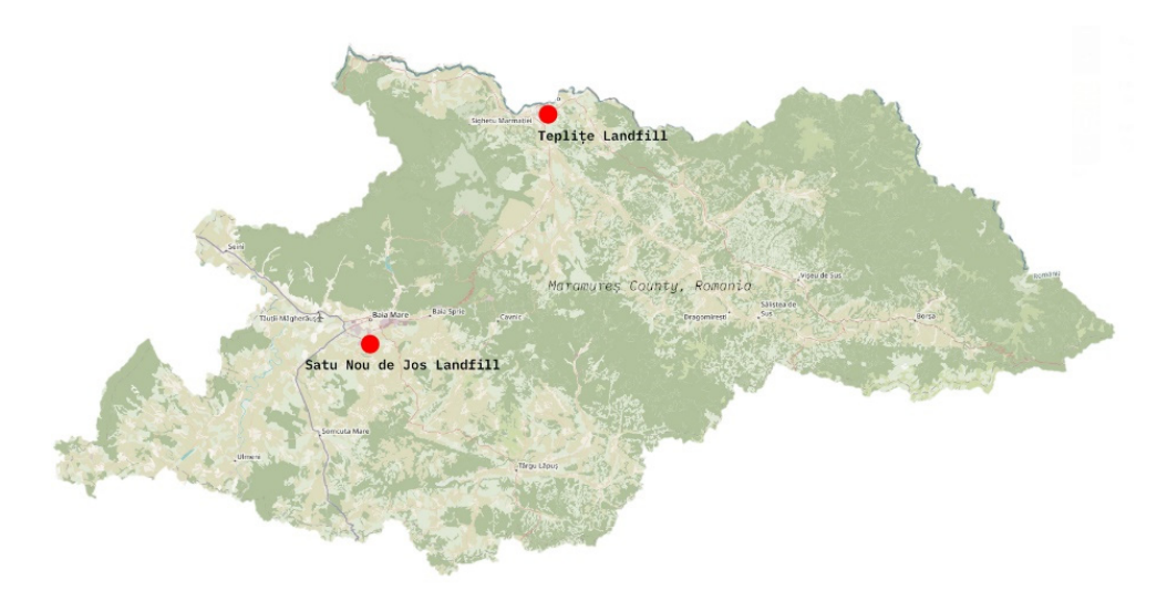
Figure 1. The landfills from Maramures County [23].

Most of the waste collected in the county is disposed of by landfill in two landfills located in Satu Nou de Jos (Baia Mare) and Sighetu Marmației (Figure 1) with an area of about 22 ha and a capacity of 4.2 million cubic meters are managed by two private companies [22].