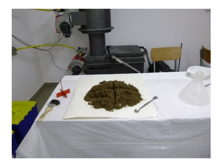
Figure 3. Ground sample.

Thus, five samples, each 1 kg, were selected from the 2 landfills in Maramures County. The five samples were prepared and subjected to analysis and determination. After a first drying and the determination of the relative moisture, the samples were ground with Cutting Mill PULVERISETTE 15, the material resulting after grinding was sieved and homogenized (Figure 3).