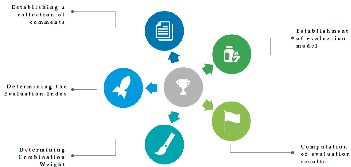
Figure 1. Establishment process of the improved fuzzy comprehensive evaluation method (IFCE) model.

Considering the factors such as the difficulty of quantifying the index of desulfurization process and the uncertainty of weight, it can be concluded that the traditional comprehensive evaluation methods mentioned above are not suitable for the evaluation of this case. In this paper, 12 representative evaluation indexes were selected according to the actual situation of desulfurization process and the three main aspects of cost, benefit and process requirement. On basis of building a fuzzy comprehensive evaluation model, the traditional fuzzy comprehensive evaluation method was improved, and an improved fuzzy comprehensive evaluation method was put forward to evaluate the comprehensive evaluation of desulfurization process method. A more scientific and reasonable comprehensive evaluation and analysis was made. The element diagram of the improved fuzzy comprehensive evaluation method (IFCE) model is shown in Figure 1.