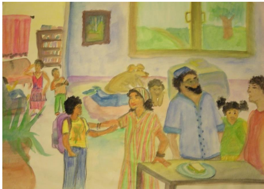
Figure 7. Kinetic Family Drawings with teens—cultural considerations of FOO.

Although I am not trained as a psychologist or an administrator of most psychological tests, I do find that using our standard art therapy assessments can be immensely helpful in holding the unique and particular aspects of clients' experiences while also paying attention to normed features or socio-cultural aspects. A simple example is my use of the kinetic family drawing (KFD) assessment with a 15-year-old teen of Middle Eastern background (Figure 7). The simple guidance—"Draw you and your family doing something together"—as part of our initial time together opened the door to exploring his personal memories of his childhood home and his story of immigration. It also offered a glimpse into the shared cultural understandings of family of origin (FOO), which was defined differently than in the United States, an exploration of a typical living environment for him, and the way touch and space representations differed from the typical KFDs I see.