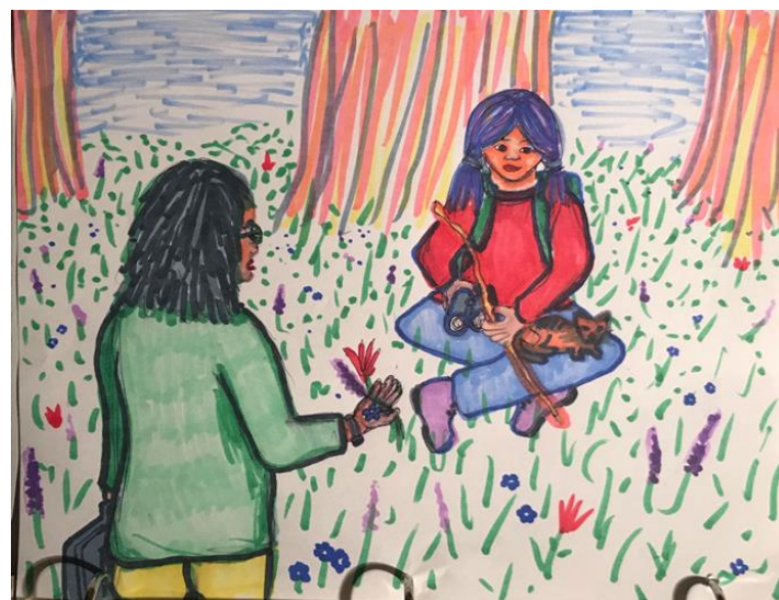
Figure 4. A mother-daughter dyad explore differing gender identities through art.

An example of such a use of art can be seen in Figure 4, an image a mother created for her daughter in a joint session in which she addressed her hopes and fears that were related to her daughter being a 12-year-old girl. Much of the conflict between them revolved around the mother's behavioral expectation from her daughter, which diverged greatly from what the daughter wanted and what she perceived as expected and validated by her peers. When exploring her own image and reflecting on it, the mother could see that in her drawing her daughter seemed younger than her current age (realizing part of the challenge was developmental). She could also see that her own wishes and experiences as a girl and the difficulties of becoming a woman were projected on her daughter. When both mother and daughter could process these insights, a greater empathy emerged, and the image itself was later replicated and modified—a reflection of their evolving perception of themselves and their relationship.