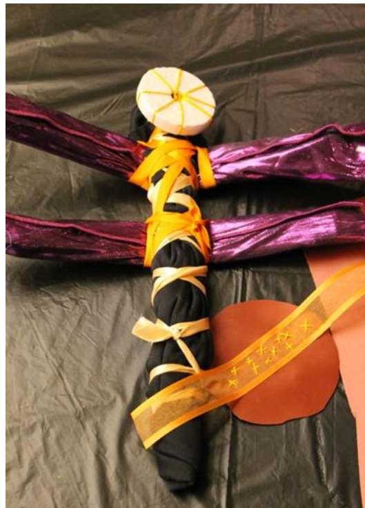
Figure 3. R and F create a dragonfly in an open studio in a shelter/community work.