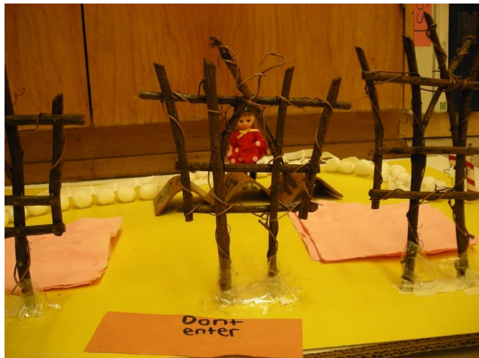
Figure 1. Working with a child in the school system.

The art piece (Figure 1) shared here allowed D to use materials that were novel and appropriately challenging for his age (hot glue gun) and produced an art product (construction of found objects) that he was proud of (he did not feel comfortable drawing). The fact D could choose the materials enabled me to support the creation of a scene he developed and controlled, which fostered his sense of safety and freedom to explore and allowed him to reveal aspects of himself—in essence, his fragility—that he rarely presented in the classroom. The resulting three-dimensional piece allowed us to interact with the child behind the “Don't enter” sign while keeping him safe psychologically behind the play and metaphorical figure. His ability to share more vulnerable sides helped me better advocate for his needs in the classroom and generate more empathy from his school staff.