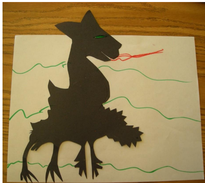
Figure 2. L's cut paper monster emerges before her surgery.

Preliminary studies comparing the effectiveness of art therapy and other expressive modalities, such as music therapy, suggest that the child's source of agony—for example, struggling with physical pain compared to alleviated anxiety and depression—might be better treated by one modality versus another [43]. In Figure 2, for example, a 15-year-old child (L) who was meeting the art therapist before a scheduled surgery in her pelvic area was cutting shapes from black cardboard paper, which she said was a way to play and relax. One of the shapes that emerged developed into a monster which she later pasted onto a white paper as a background. As she continued to embellish the overall creation, a shift occurred from tactile a focus to a more emotional cognitive, and later symbolic, processing [3], and she was more able to process the image to communicate her fear of the illness, the surgery, and their potentially dangerous outcomes.