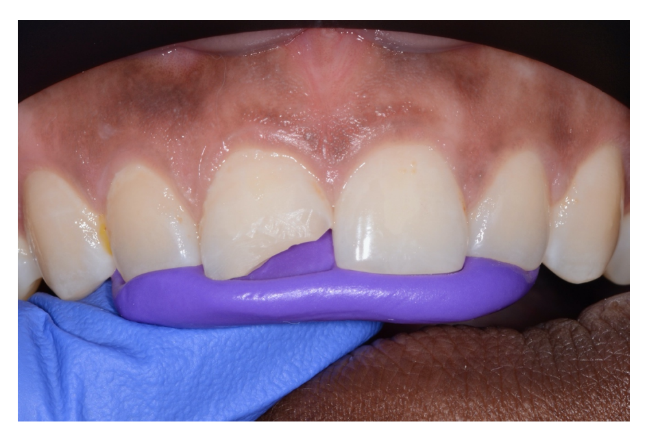
Figure 4. Fitting of the layering key after production of an enamel bevel in tooth 11. (©Max Diekamp).

Figure 3. Layering key made of kneaded silicone (bottom), and kneading mass used to promote patient cooperation in the sense of the tell-show-feel-feel-do technique (top). (©Max Diekamp).