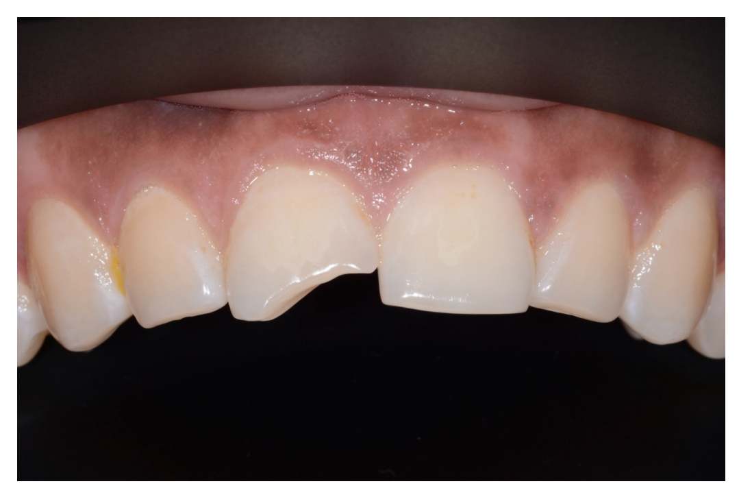
Figure 1. Initial situation, enamel-dentine fracture of tooth 11 of an autism spectrum disorder (ASD) patient. (©Max Diekamp).

an "uncomplicated crown fracture of tooth 11" was diagnosed. At the time of the initial examination in the Department for Special Care Dentistry (May 2018), there were no bruise marks on the patient's face or other body parts and no signs of intraoral abnormalities such as bleeding, swelling, or injuries, for example, from a fall. There had been no way of establishing from the people in the boy's social environment as to when and how the enamel-dentine edge of the tooth might have broken off. Obviously, the trauma to this tooth had occurred at some previous time and the cause could no longer be determined. The patient's caregivers (residential caregiver and mother) were informed that restoration of tooth 11 was feasible. Although they welcomed the prospect of possible treatment, especially because of the poor aesthetics of the chipped tooth, they also pointed out, several times, that the general medical and social characteristics of the boy might make treatment difficult.