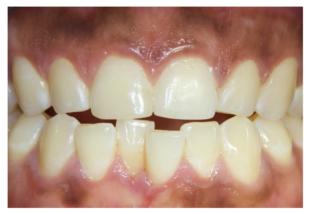
Figure 5. Control of the restoration of tooth 11 in the ASD patient after three months. (©Dr. Peter Schmidt).

The restoration filling was built up in partial steps using different composite materials (enamel mass, body mass, dentine mass-Filtex XTE). First, a thin layer of enamel mass was placed in the layering guide, adapted, and then light-cured, intraorally, to create a thin enamel shell on the palatal side. A small core consisting of body and dentin materials could, subsequently, be built up in this shell. Then, this core was also coated with enamel on the vestibular side. In a last step, the filling was finished with a carbide finisher (HM48LU 012, Hager & Meisinger GmbH, Neuss, Germany) and polished with polishing wheels (Sof-Lex<sup>™</sup>, 3M Espe GmbH, Seefeld, Germany) and ceramic polishers (9771f and 9771C, Hager & Meisinger GmbH, Neuss, Germany). The total time needed for the restoration per se was about 45 min. This time estimate did not include the time required for welcome and farewell of the patient and a short pre- and debriefing session, or time spent answering interim questions from the patient's mother. Because the patient had become very restless during the final polishing process, high gloss polishing could not be completed during the treatment session and had to be done in a subsequent control session (Figure 5). The recall was set at a quarterly interval.