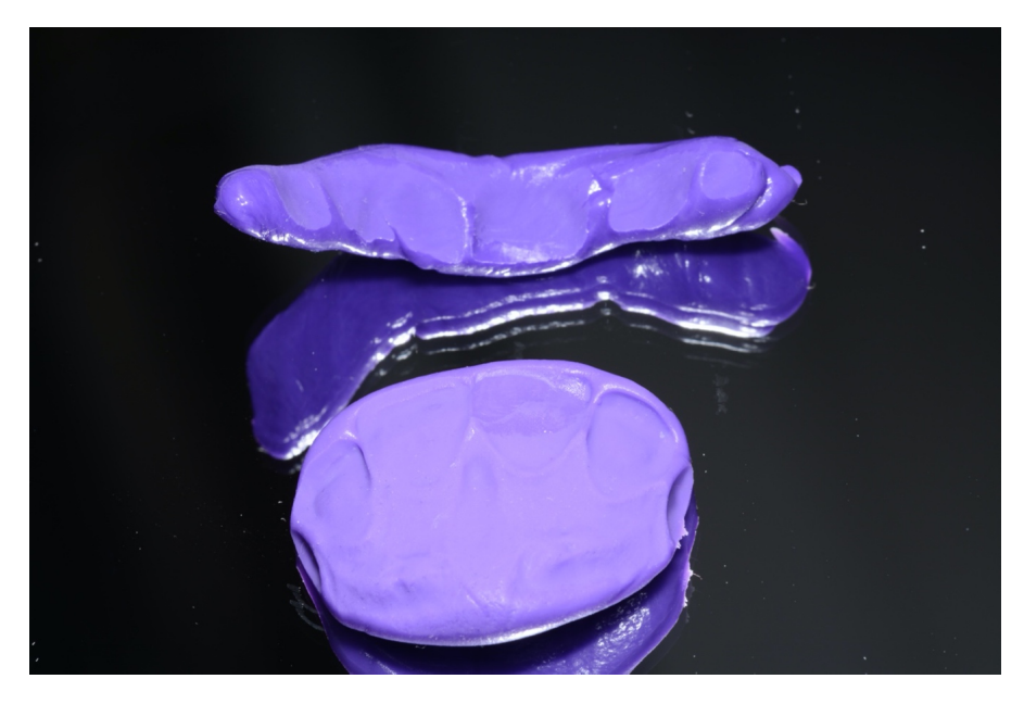
Figure 3. Layering key made of kneaded silicone (bottom), and kneading mass used to promote patient cooperation in the sense of the tell-show-feel-feel-do technique (top).

the enamel margins of the defect were first chamfered with rotating instruments (Diamant 863G and 833G, both green and red ringing, Hager & Meisinger GmbH, Neuss, Germany) (Figure 4). Palatinally, only the refraction of the enamel prisms was performed, while an approximately 2 mm wide bevel was prepared vestibularly. Because the defect was only medium sized and the rotating instruments were used only briefly, there was no necessity for local anesthesia. Furthermore, in agreement with the supervising lecturer, the operating dental student deliberately avoided using a rubber dam, as this procedure could easily have been too much for the patient to tolerate. Since treatment in anterior regions of the oral cavity is feasible with only relative drainage, cotton rolls and permanent suction were the drainage method of choice in this case. In a next step, the tooth surface was prepared for an adhesive bond with the composite resin restorative material using an enamel-etching technique. For this purpose, 36% phosphoric acid gel (DeTrey Conditioner 36, Dentsply Sirona GmbH, Bensheim, Germany) and a multi-bottle adhesive system (Optibond FL, Kerr GmbH, Biberach, Germany) were used.