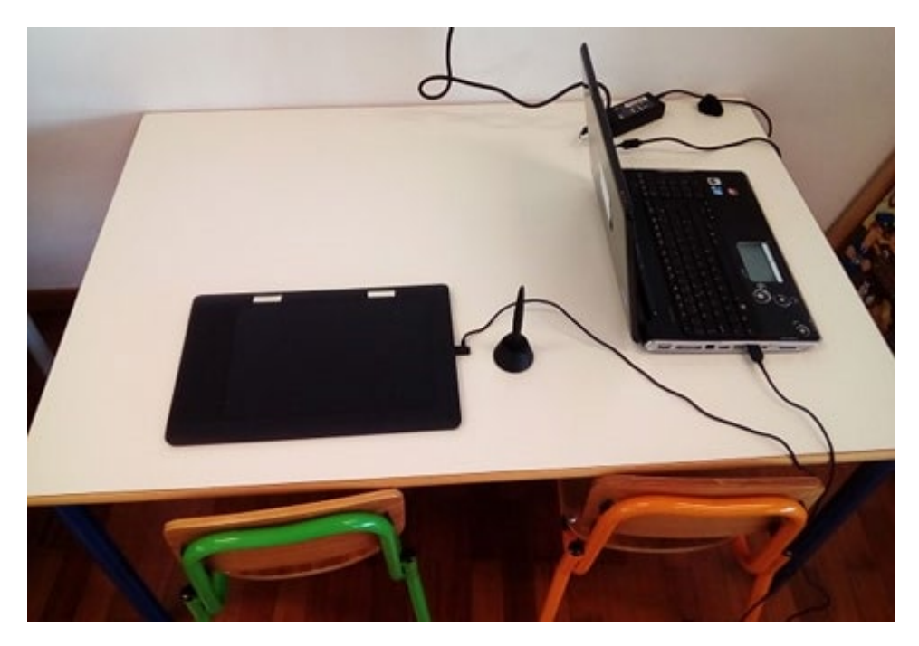
Figure 1. The experimental graphomotor setup with a pen tablet, school desk, and chairs. The experimenter was seated on the right side and could monitor the pen movements in real time on a laptop.

The participants were seated in front of the tablet, which was centered on the participant's midline in front of their chest. The heights of the chair and table were adjusted, and the laptop computer was set aside so that the real-time visual feedback of the child's pen movements was available only to the experimenter (see Figure 1). The participants were invited to copy the BHK text for 5 min.