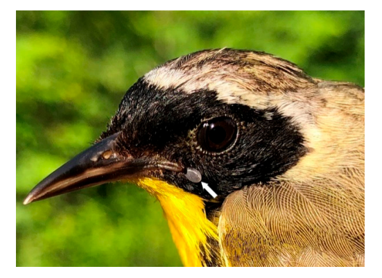
Figure 4. Common Yellowthroat, adult male, parasitized by nymphal Ixodes scapularis ticks. Since these nymphs were collected during the nesting and fledgling period, this bird parasitism indicates that this location has an established tick population.

transmitted to these attached larvae. Since these juvenile birds have just fledged the nest, and had scant exposure to ticks, it is possible that the mother birds were spirochetemic, and may have transmitted Bbsl to their offspring. In addition, two I. muris nymphs were collected from a juvenile Common Yellowthroat during southward fall migration, and one of these co-feeding nymphs tested positive for Bbsl (Figure 4). Of epidemiological significance, I. muris is a Lyme disease vector tick that has vector competence for Bbsl, and can transmit Lyme spirochetes to humans [22].