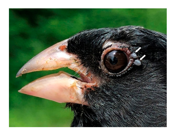
Figure 7. Rose-breasted Grosbeak, adult male, parasitized by Ixodes scapularis nymphs. Since this bird parasitism occurred during the nesting and fledgling period, these attached nymphs denote an established tick population in this locale.

A heavily infested songbird can initiate an established population of blacklegged ticks [32]. Whenever juvenile songbirds are infested with I. scapularis ticks, these tick collections clearly indicate that an established population is present. For example, ground-frequenting songbirds, such as the Rose-breasted Grosbeak, provide short-distance dispersal of ticks during the nesting and fledgling period (Figure 7).