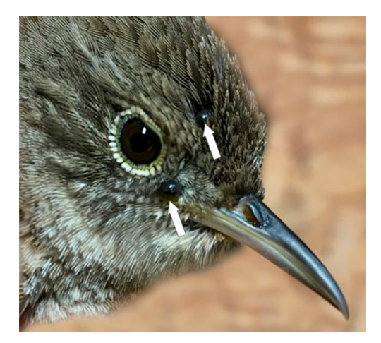
Figure 3. House Wren parasitized by Ixodes scapularis nymphs. While ground-dwelling passerines are foraging for morsels on the forest floor or meadow, they can be parasitized by bird-feeding ticks.

Of special significance, we present the first documentation of a potentially unique Bbsl strain in Canada. This de novo Bbsl strain (GenBank accession number MH290738) was detected in an I. muris larva that was collected from a House Wren (Table 3), and is the first account of this Bbsl strain in this tick species in Canada (Figure 3). Using a portion of the flaB gene, this Bbsl strain is a 100% match to a Wisconsin strain W97F51 obtained in 1997 [55]. Moreover, the flaB fragment sequence is ~99% identical to Borrelia lanei reference strains. This de novo Bbsl strain may possibly represent a distinct and different Bbsl genospecies. Thus, we are simply calling this novel strain B. burgdorferi sensu lato. Moreover, since this I. muris larva was collected during southbound fall migration, this bird parasitism suggests that this unique Bbsl strain may be established in Canada.