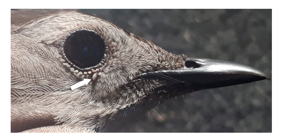
Figure 2. Gray Catbird parasitized by an I. scapularis nymph at Site 5. This nymph was infected with Babesia odocoilei . The white arrow points to the location of an engorged tick (the same below).

Two single I. scapularis nymphs were collected from two individual Gray Catbirds at Site 5 on 24 May 2018. Each of these nymphs was infected with B. odocoilei piroplasms (Figure 2).