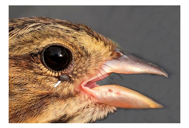
Figure 5. Song Sparrow, a juvenile, parasitized by three Ixodes scapularis nymphs (two are not visible). Since these ticks were acquired in close proximity to the nest, this bird parasitism indicates that an established population of I. scapularis is present within this nesting area.

During the nesting and fledgling period, ground-foraging passerines are short-distance disseminators of locally acquired ticks. In particular, juvenile (hatch-year) songbirds, which fly south for the winter, have not yet migrated. During this early summer period, a heavily infested juvenile songbird clearly shows that there is an established population of ticks within the nesting area (Figure 5).