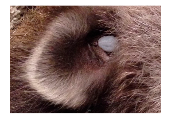
Figure 6. Engorged Ixodes female parasitizing a medium-sized mammal inside its ear. Ticks select secluded areas of the body to prevent dislodgement during grooming and preening by front paws or incisors.

Terrestrial mammals provide short-distance dispersal of ticks, and maintain the enzootic transmission cycle of Bbsl within a Lyme disease endemic area. Ticks have an innate ability to avoid premature dislodgement from their hosts. They select secluded attachment sites (e.g., inside ear lobe) that are not subject to grooming or preening (Figure 6). In order to thwart tick dislodgement, ticks will attach beyond the reach of the incisors and the front paws or toes.