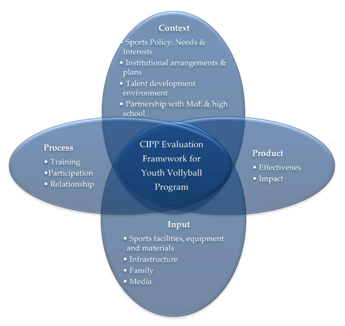
Figure 2. Hierarchical themes organizing framework.

Then the sub-themes in each theme were coded by using inductive coding, also known as open coding. The inductive coding started from scratch, and we created codes based on the qualitative data itself. In our analysis, all the sub-themes and their attributes arise directly from the study participants' responses. The inductive coding was an iterative process, which means it was thorough and relevant to the production of a more complete, unbiased look at the sub-themes throughout our data [27]. The inductive coding process included the following two steps. First, we coded each transcript line by line. As categories emerged, we used a constant comparative method to compare and refine categories as needed.