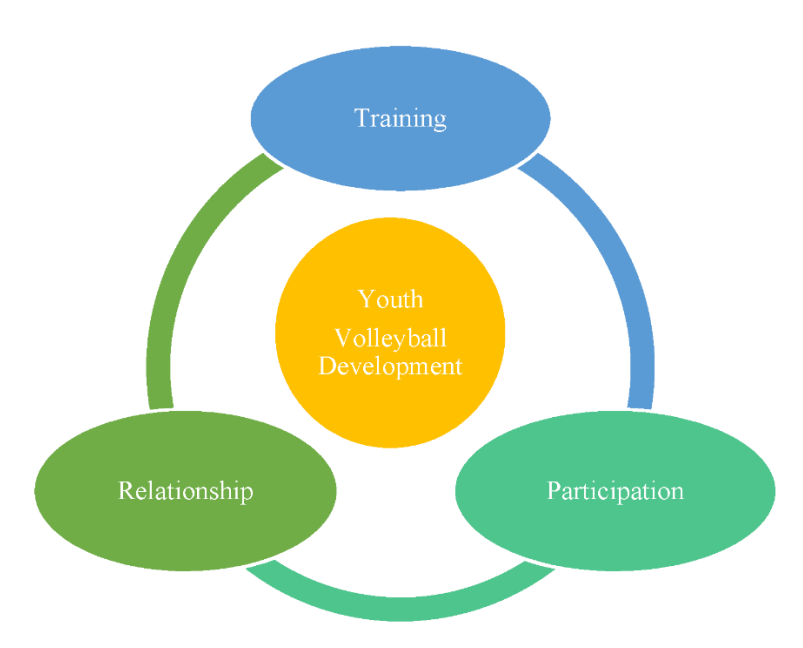
Figure 3. Process evaluation components.

As can be seen in Figure 3, the heart of the matter in the overall implementation evaluation is the youth volleyball development program. This program process is decomposed into the training, participation, and relationship components based on the evidence generated in this study.