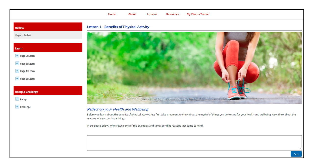
Figure 2. Sample lesson showing web design.

Through this rigorous redesign process that included repeat qualitative interviews, a markedly different health behavior intervention emerged. The newly adapted 8-week web-based physical activity intervention consisted of weekly interactive lessons, an expanded resource library with local resources and "how-to" videos, manual entry step and goal trackers, and a private social media group to be led by a wellness coach. Minimal modifications to the theory-based lesson content and behavior change techniques were needed. Instead, the major modifications to the intervention centered around strategies to foster ongoing engagement with the program, support accountability, and enhance cultural fit within the college student lifestyle. For example, the newly adapted intervention had a shorter duration (8 weeks) and more relevant graphics, examples, and statistics for the new priority population. Furthermore, the narrative text was shorter and the content related to prevention of chronic illness was reduced, while the content on the effects of physical activity on mental health and mood were emphasized. Figure 2 shows a sample of the web-based design.