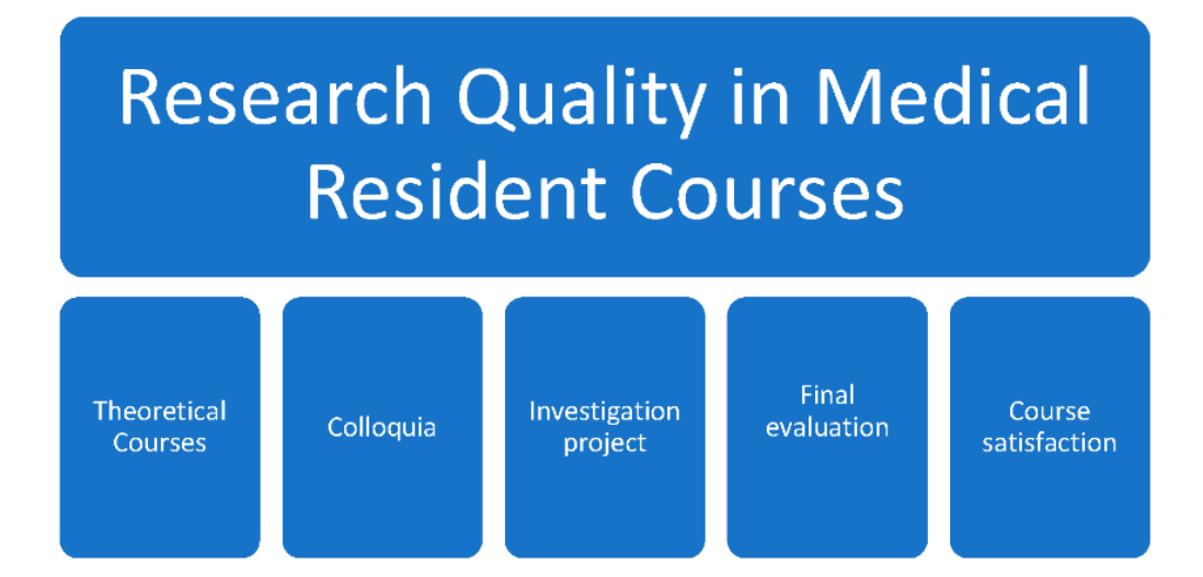
Figure 1. Dimensions: research quality.