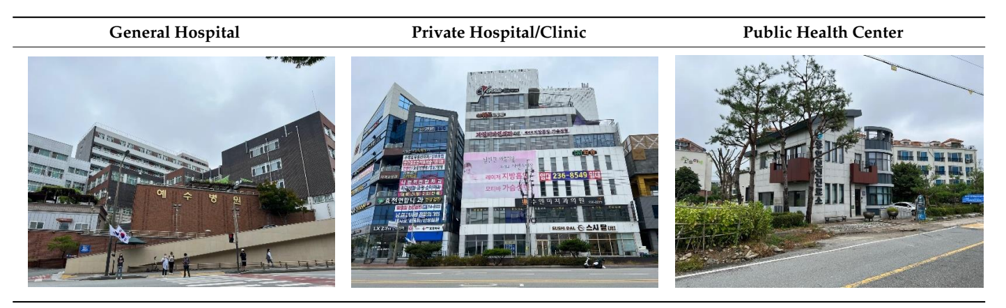
Table 1. Examples of the Three Types of Healthcare Services Explored in this Study.