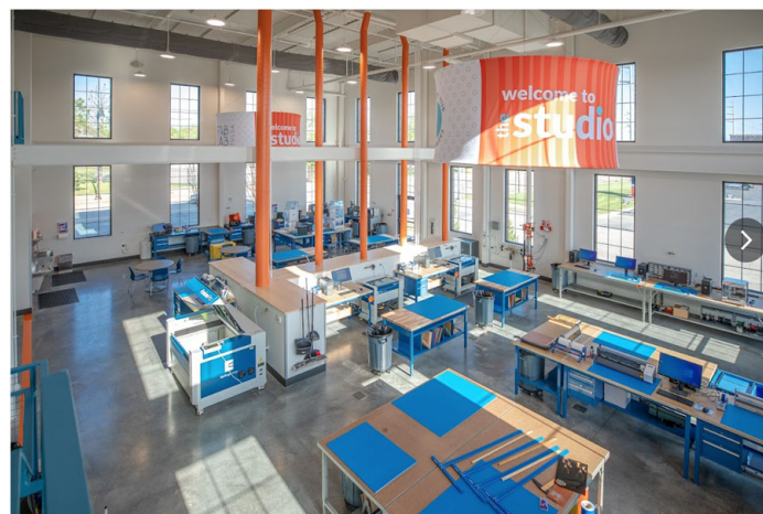
Figure 2. View from second level of a studio/workspace.