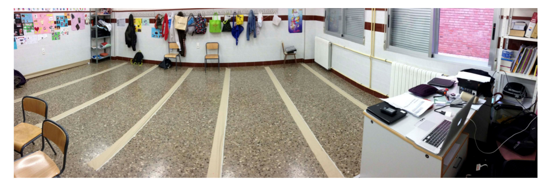
Figure 2. The classroom where the STEM problem-solving activity takes place being prepared for the sound intensity measurements.