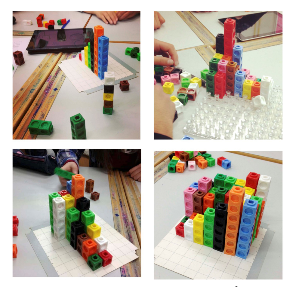
Figure 3. Student representations of the collected data using Multilink<sup>®</sup> material.