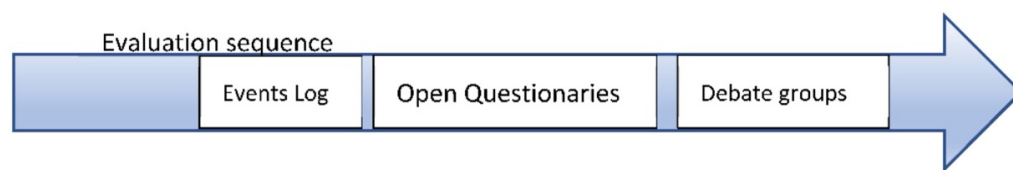
Figure 4. General Structure research in SCARLeT project.