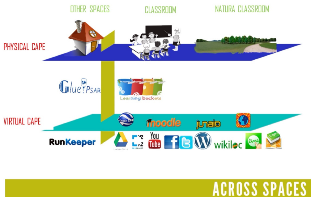
Figure 2. Ubiquity Layers of educational activity Gallego-Lema [31].

Following Stake’s [32] model of qualitative research design, we can argue that in this case two types of data sources and a mixed design were consistently used. In the design diagram (Figure 3) we can see qualitative techniques in operation, but also, in the slot dedicated to documentary sources, quantitative data provided by the LOGs of events recorded by the digital platforms. These sources were compared and contrasted during the process, while a perception study of the participants and their interactions with technology was likewise conducted. The result was a number of deeper insights into the process as a whole.