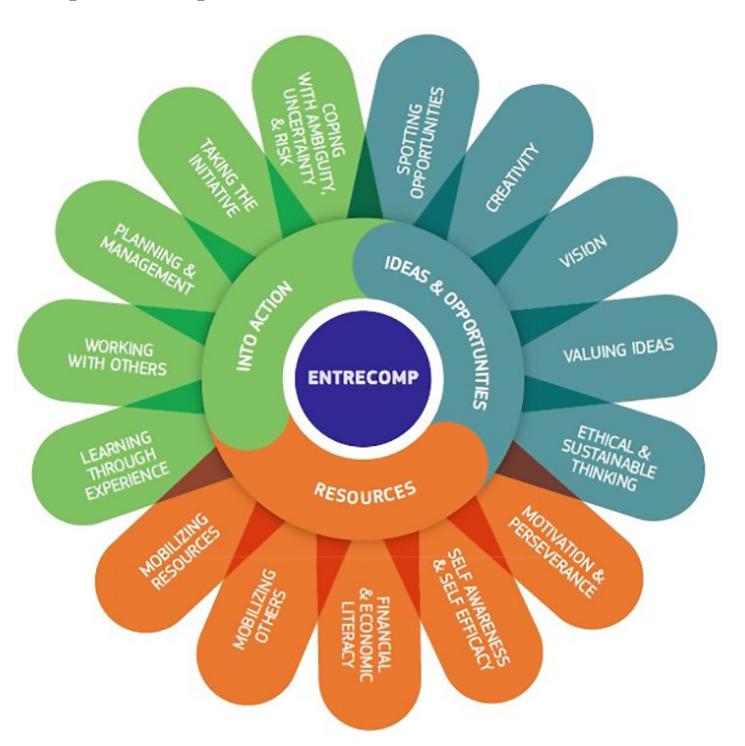
Figure 2. The European Entrepreneurship Competence Framework (EntreComp).

crement in entrepreneurship can be achieved through education and, especially, through entrepreneurship education.