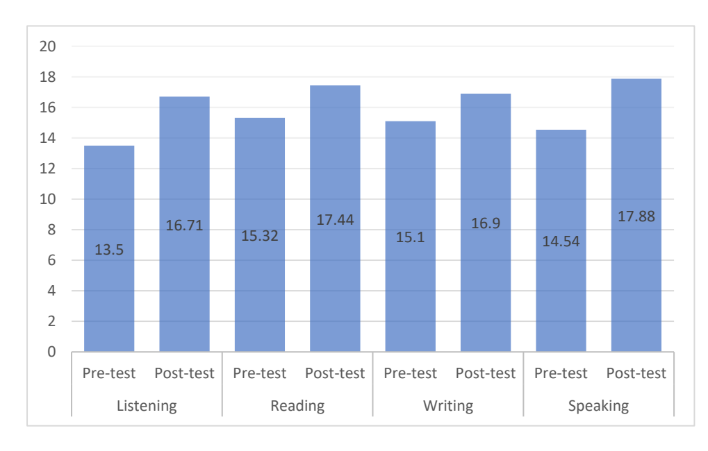
Figure 2. Descriptive results of the pre-test and the post-test on Spanish proficiency (Experimental group).

In general, the overall quality of students' Spanish knowledge in four categories improved (Figures 2 and 3).