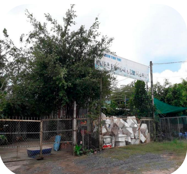
Figure 1. Tourist attractions that stopped doing business during the COVID-19 pandemic.

The majority of the managers of tourism service businesses in this study believed that the COVID-19 pandemic has impacted local business either at a serious or very serious level, at 49.3% and 40%, respectively. According to the statistics, very few enterprises admitted that the COVID-19 pandemic has had moderate or non-serious impacts on their business, at 10.4% and 0.4%, respectively. This finding affirmed the serious impact of the pandemic on the tourism and hospitality industry (Panzone et al. 2021).