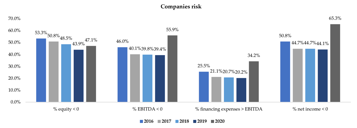
Figure 1. Companies risk—Portugal.

Regarding the net result of the Portuguese restaurant companies, in 2019 there was a profit of EUR 210,229; in 2020, there was a loss of EUR 524,198. In 2020, observing the net income of restaurant companies, 65% of the companies reported a negative net income, 21 p.p. more than in 2019. However, years before, such as 2018, 2017, and 2016, had higher percentages of negative net income (resulting from the previous economic crisis in Europe). Regarding the percentage of negative equity, it is perceived that until 2019 the percentage was reduced; however, with the pandemic crisis, in 2020, the percentage increased. The same scenario occurs for the percentage of companies with negative EBITDA and for companies with financial expenses higher than EBITDA (Figure 1).