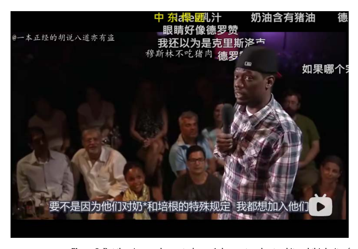
Figure 5. But the viewer who posts danmu 1 does not understand it and thinks it refers to "cream" because cream may be made of lard, and it shares the first character with that taboo word in Chinese. And some of the following danmu comments point out this misunderstanding either by spelling out the English taboo word " titties " or explaining the actual in Chinese or English.

As the results show, about 16% of the taboo language is partially or entirely omitted in the TT. Based on the observations, not many viewers specifically comment on these strategies unless the omitted parts cause confusion or misunderstanding. For example, in a video clip of Michael Che's stand-up comedy show, he talks about converting to Muslim only if two things are not in the way: bacon and titties , and the partial omission strategy is adopted when rendering the latter into Chinese (see Figure 5).