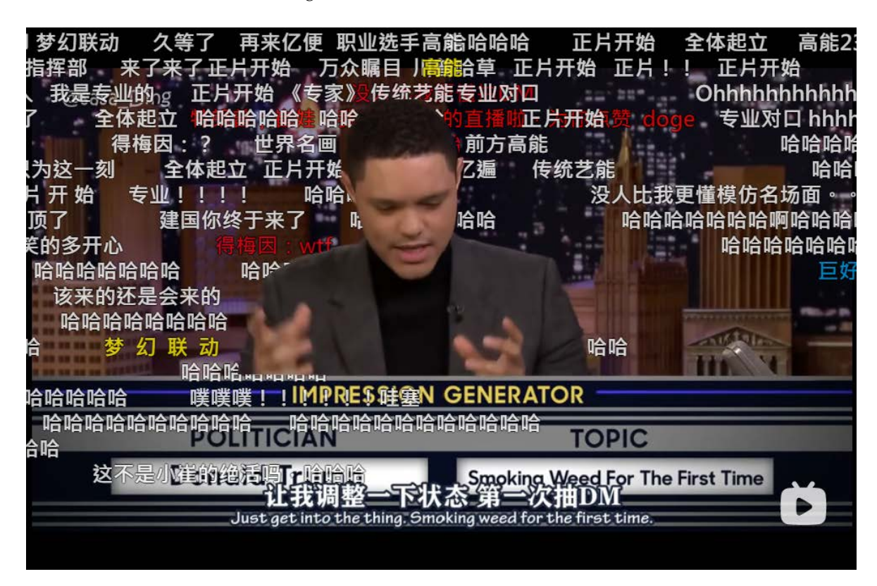
Figure 3. DM instance.

For the only drug reference in this study, when "smoking weed" in the ST is rendered as a pinyin acronym "DM" (see Figure 3), some made a connection to the word "dark matter", which shares the acronym "DM"; some mentioned a scene from an American TV series Friends that is relevant to smoking (ST: 突然让我想起来老友记里甘瑟抽钱德勒那跟烟的台词, BT: this suddenly reminds me of Gunther's line when he takes a drag off of Chandler's cigarette in Friends).