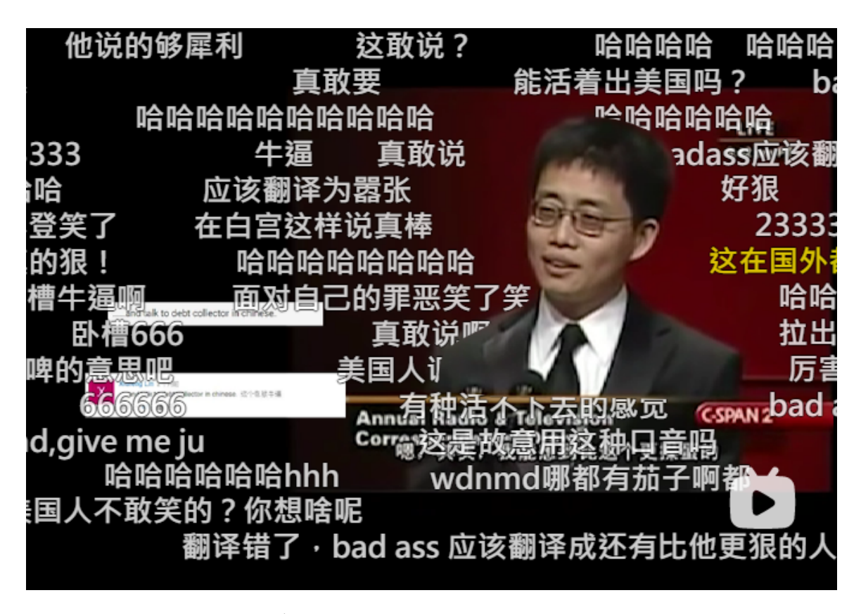
Figure 6. Badass instance.