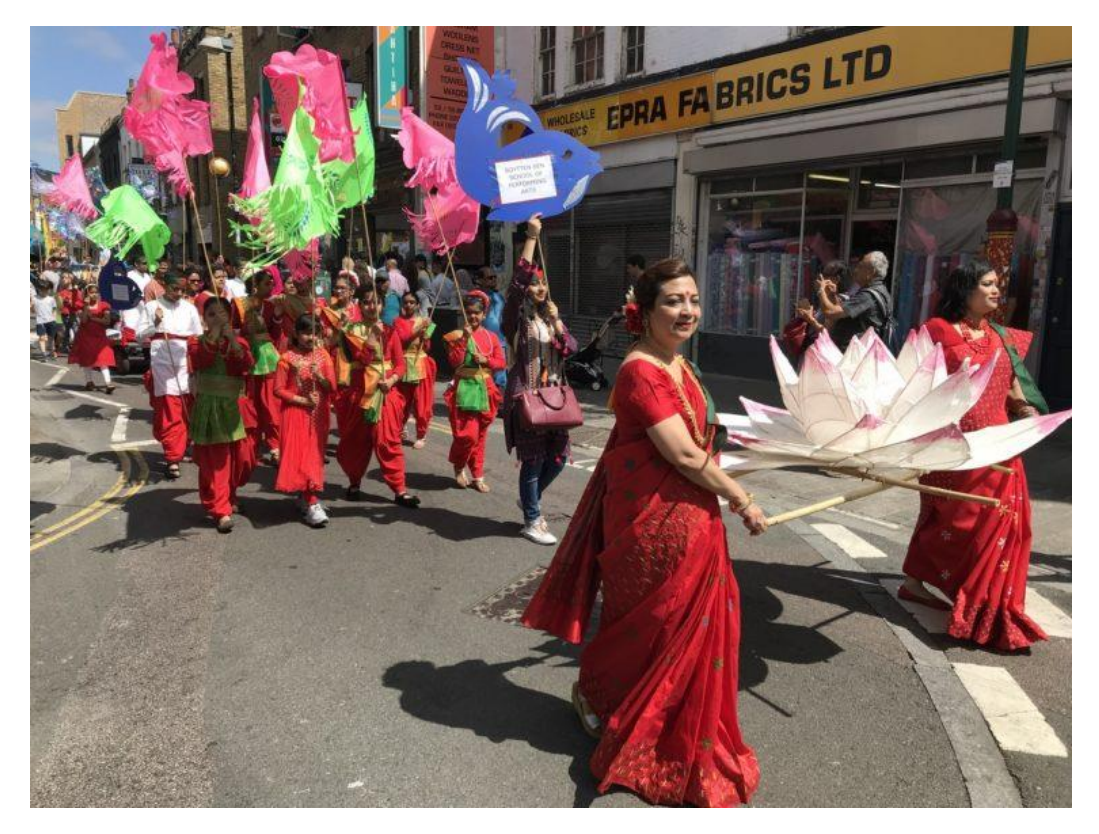
Figure 5. The Brick Lane Boishakhi Mela Grant Parade.

Other examples of adaptive reuse in London include the conversion of Sir Giles Gilbert Scott's abandoned Bankside Power Station into the Tate Modern, one of the most iconic museums of the global city; or the regeneration project of the Battersea Power Station as a shopping and leisure destination. What these stories suggest is that there is more to adaptive reuse than merely resource efficiency. It is about a wider integrated approach to