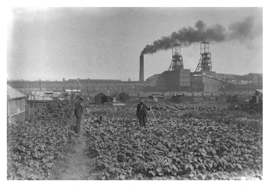
Figure 6. Fryston Colliery and Castleford allotments.

Just one of the many kinds of industrial heritage present across England which is a building of local interest is the Queen's Mill, located at the River Aire in central Castleford (Figure 6). The Mill is owned by the Castleford Heritage Trust (CHT), established in 2000 to 'promote the community's heritage and culture to build a strong, successful community' and to 'use natural as well as cultural heritage as a vehicle for regeneration and improving educational opportunities' [102]. The Trust also promotes access through community involvement to industrial heritage, and as of 2013, purchased and moved into the Queen's Mill, kicking off a major refurbishment project.