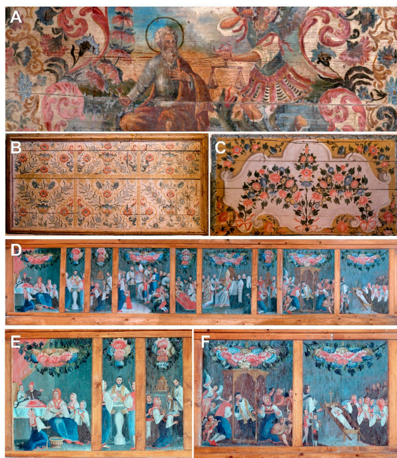
Figure 5. (A)—Antependium in Church of St. Anthony of Padua in Trpanj; (B,C)—Antependia in Church of St. Martin in Žuljana; (D)—Polyptych Birth and Death with the Seven Holy Sacraments on wooden fence by choir in Church of Our Lady of the Rosary in Putniković; (E,F)—Details of first and final parts of polyptych.