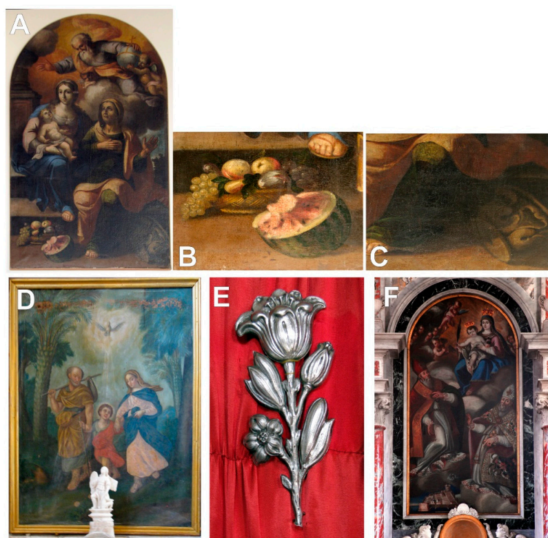
Figure 2. (A)—St. Anne and Our Lady with Jesus Christ and Our Father in Chapel of St. Anne in Kučište; (B,C)—details from lower left and right parts of paintings; (D)—The Escape to Egypt, and (E)—Health-related Votive Tablet in Church of Christian's helpers in Orebić; (F)—The Virgin with Child, St. Blasius, and St. Nicholas in parish church of St. Blasius in Janjina.