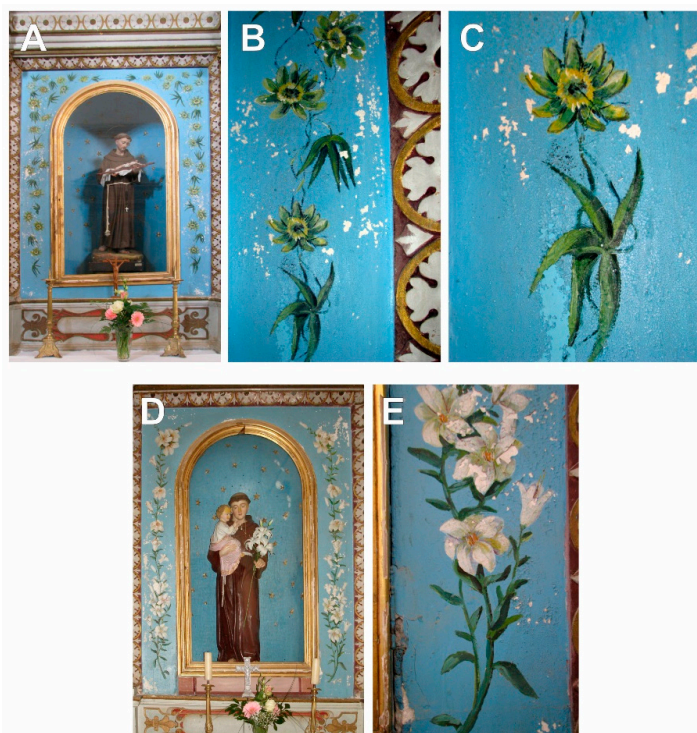
Figure 3. The altars of St. Francis of Assisi (A) with details on Passiflora caerulea L. (B,C); St. Anthony of Padua (D) and details on Lilium candidum L. (E) in Franciscan Monastery and Church of the Great Lady in Podgorje.