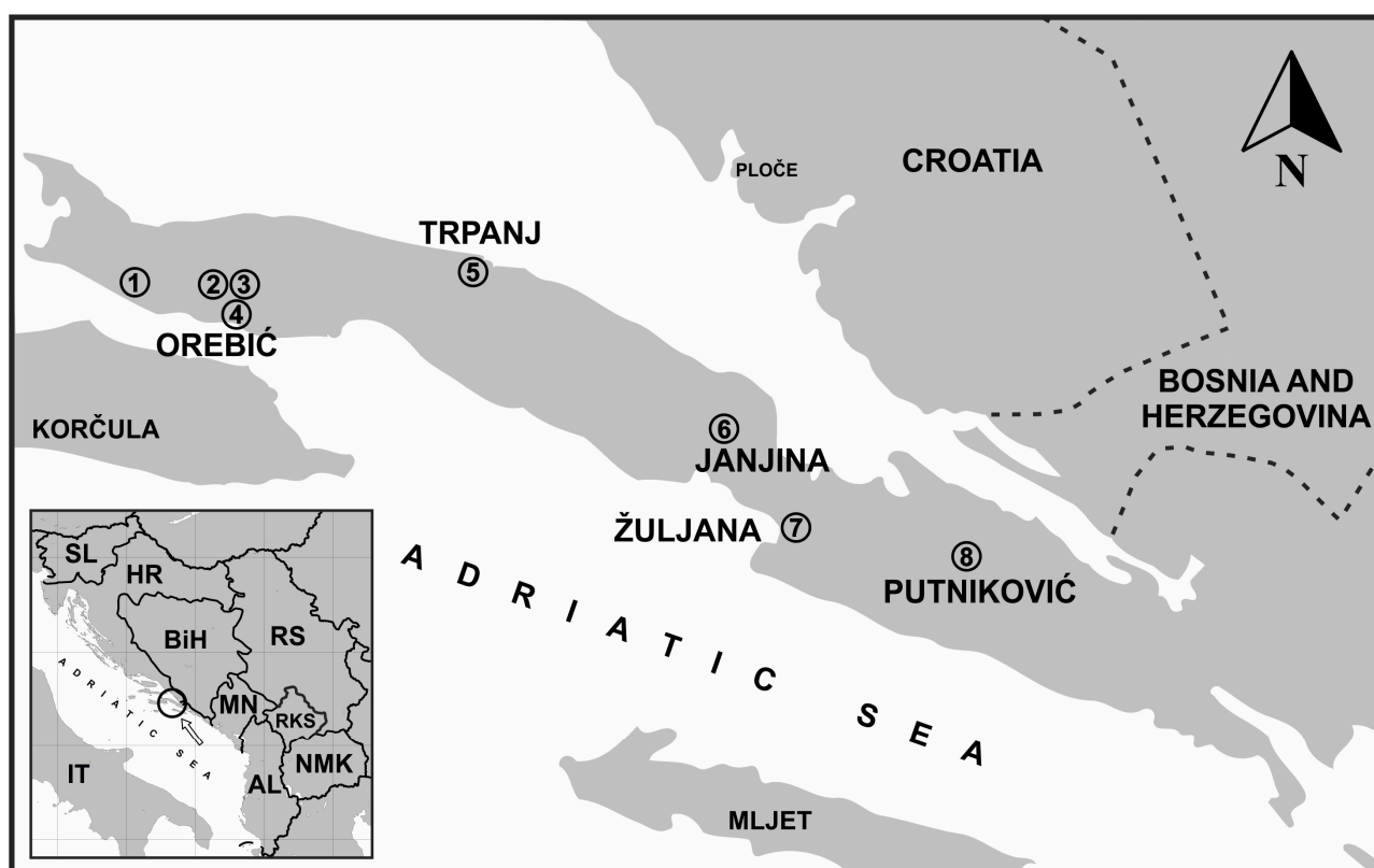
Figure 1. Map of Pelješac peninsula and its location on southeastern Adriatic coast (SE Europe). Numbers indicate location of churches and monasteries where artworks were examined: 1—St. Anne Chapel, Žukovac, near village of Kučište; 2—Franciscan Monastery and Church of the Great Lady, Podgorje; 3—Church of Our Lady of Carmel, village of Carmel, Podgorje; 4—Church of Christian’s helpers, Orebic; 5—St. Anthony of Padua Church, Trpanj; 6—St. Blasius Church, Janjina; 7—St. Martin Church, Žuljana; 8—Church of Our Lady of the Rosary, Tomislavovac, near village of Putniković (for a detailed description see Section 2.2). Abbreviations: IT—Italy, SL—Slovenia, HR—Croatia, BiH—Bosnia and Herzegovina, MN—Montenegro, RS—Serbia, RKS—Kosovo, AL—Albania, NMK—North Macedonia. The circle on the map in the lower left corner indicates the research area in the SE European context.

Phytogeographically, the peninsula belongs to the Mediterranean Region, the Eastern Mediterranean Subregion, Adriatic Province, and the Epiro-Dalmatian Sector ( sensu [22]). It is predominantly composed of carbonate rocks. The climate in this area is Mediterranean with mild, humid, and rainy winters and dry and hot summers ( Csa subtype of Mediterranean climate, sensu ) [23,24]. This climate enables the development of eu-Mediterranean vegetation dominated by evergreen shrubs and sclerophyllous trees (maquis), with the most important tree species being the holm oak ( Quercus ilex L.). Today, the Pelješac peninsula is one of the Important Plant Areas (IPAs) in Croatia and has a high structural diversity of vegetation [25,26]). On the peninsula, there are sites rich in endemic flora [27], while the larger part of the peninsula is covered by the NATURA 2000 network of protected areas in Croatia [28,29].