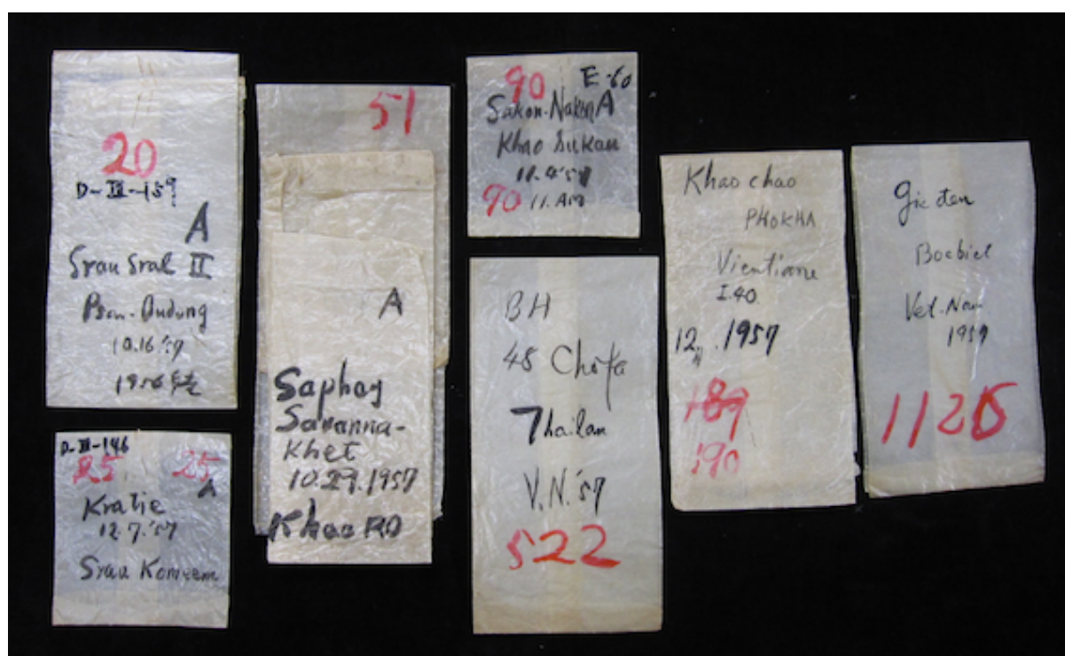
Supplementary Figure S1. Original seed envelopes. Prof. Hamada used these envelopes to collect seeds of the rice local varieties in Indo-China countries in 1957.