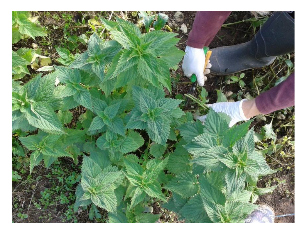
Figure 3. Harvesting nettle in open field.

Nettle is characterized by its ability to retrovegetate, so it can be harvested several times during the growing season (Figure 3). The stage at which it is harvested depends on the objective of cultivation, e.g., intensive growth of the plant before flowering when the objective of cultivation is a fresh leaf for human consumption. Harvesting is carried out above the first two nodules to allow the plant to regenerate [9,41].