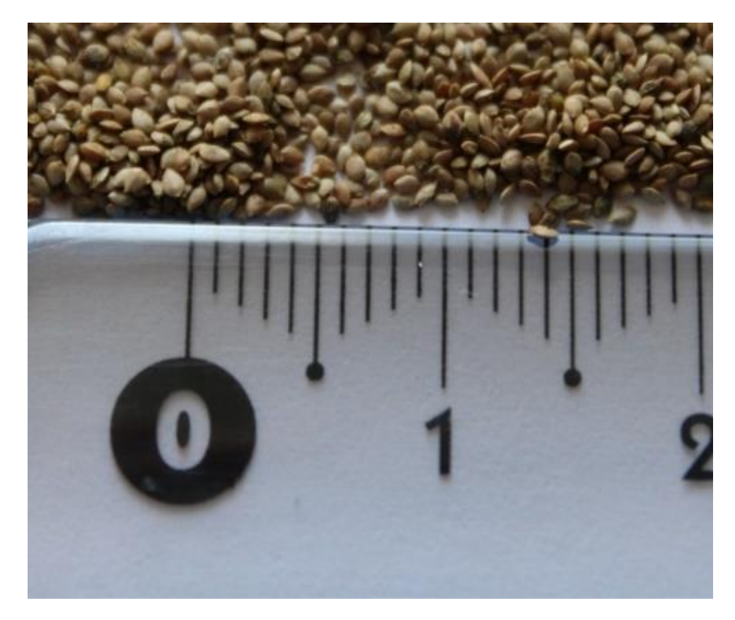
Figure 1. Urtica dioica seeds.

Since most research studies analyze the chemical composition of wild-collected nettles, it is important to emphasize that it is difficult to find detailed information on both appropriate cultivation techniques (field or greenhouse) and the nutrient quality or SM content of the cultivated plant material. Literature indicates that nettle can be propagated both generatively and vegetatively, by direct seeding, by seedlings, or by planting underground stems (rhizomes) [10,41]. In generative propagation by seeds, it should be noted that nettle seeds are quite small, and their absolute weight is about 0.15 g (Figure 1). Therefore, when sowing in the field, it is important to prepare the sowing layer adequately (fine preparation of the soil surface) and not to sow deeper than 1 cm. Since nettle seeds have a hard seed coat, which makes germination difficult, sowing in autumn (but before the late autumn frosts) is more favorable than sowing in spring. In this case, the dormancy of the seed is canceled, and the seeds germinate the following spring.