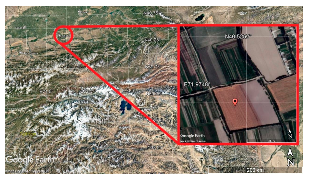
Figure 1. Location of the study area and the soil section of the irrigated meadow saz soil in the image from the Google Earth service.

The wheat variety "Polovchanka" was chosen for sowing. The area was limited from 3 sides by open-type drains and only from the north by the drainage water collector. The total area measured 11.5 hectares (Figure 1).